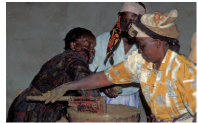
Curt Camermark/The World Bank

It is clear that gender-blind adaptation programmes are potentially harmful to development, as they tend to exacerbate existing inequality. With respect to vulnerability to climate change, this means that men's vulnerability may decrease while women's stays the same or even increases. UNDP employs the approach of gender mainstreaming to ensure that this does not