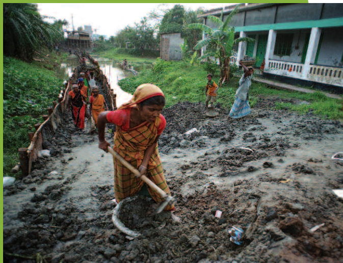
Scott Wallace/The World Bank