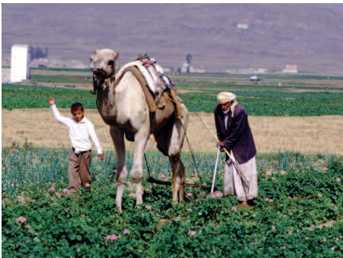
Bill Lyons/The World Bank