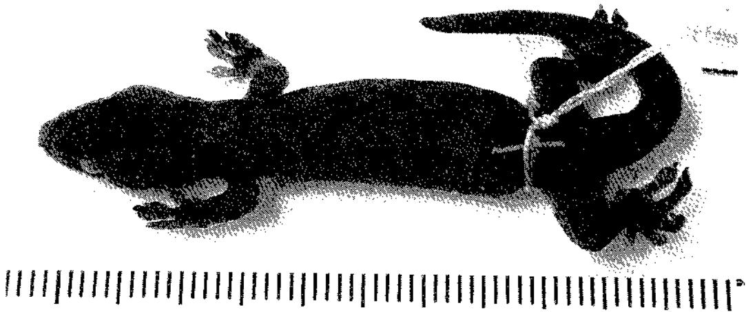
Fig. 1. The holotype of Lepidodactylus tepukapili , USNM 531712.