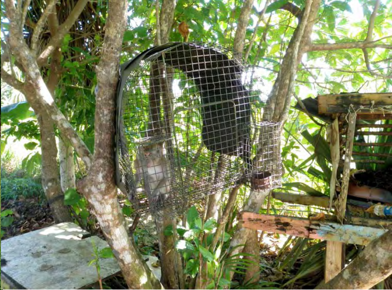
Clockwise from top left: Crop damage by macaques, Angaur. Betelnut damage on Angaur. Captive macaque. Owner collects pet macaque.