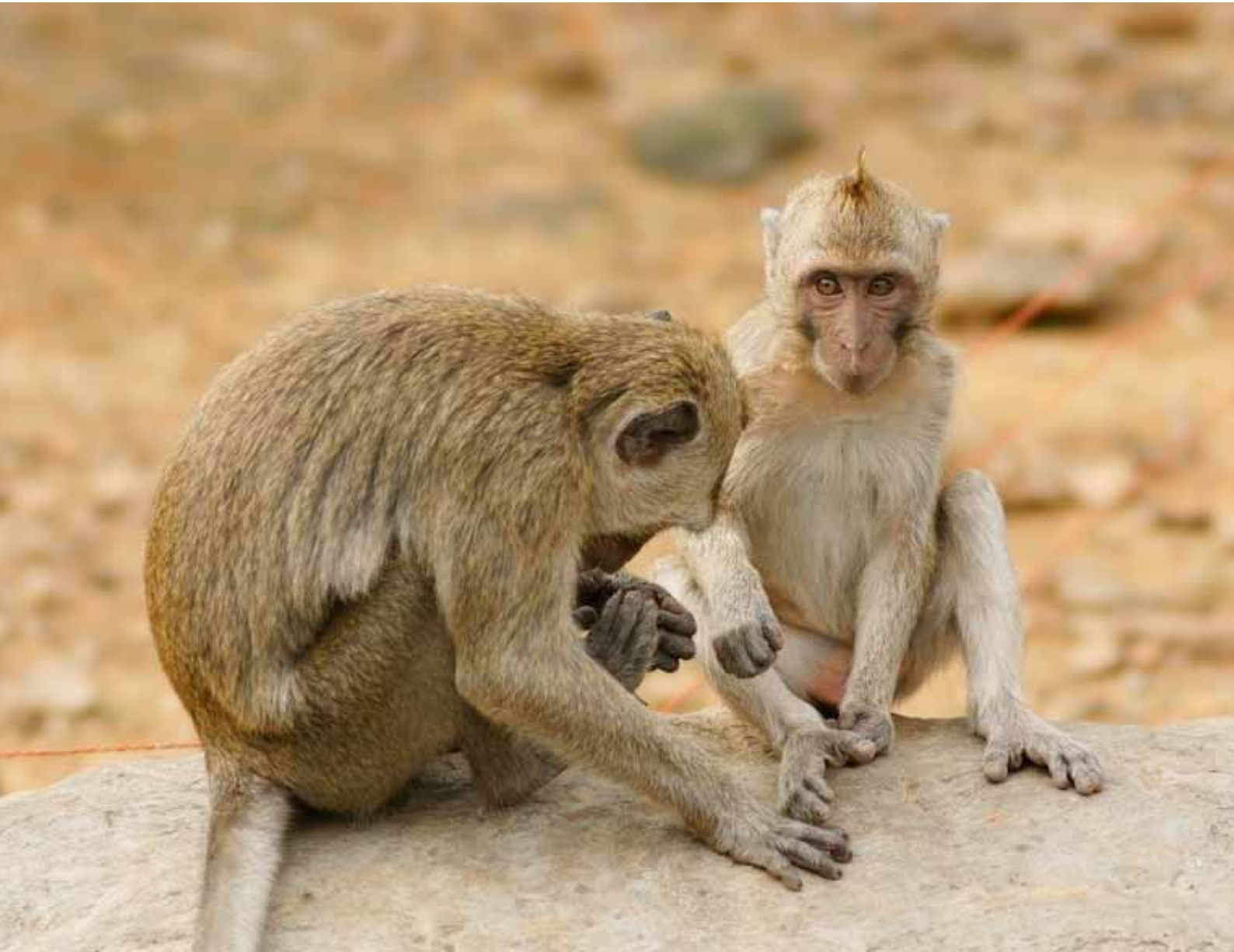
Crab-eating macaque.