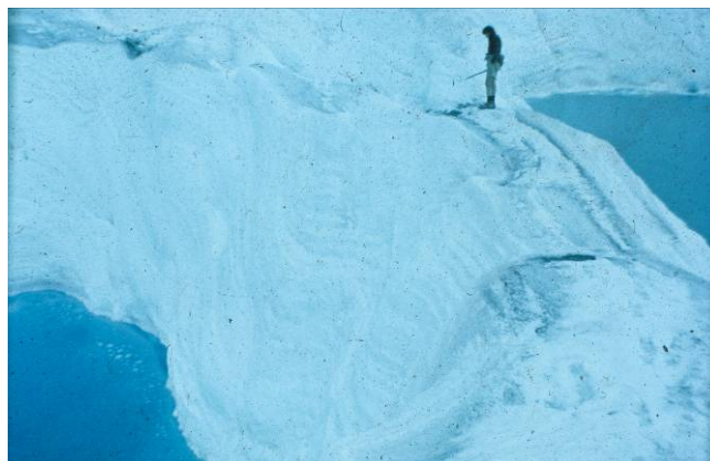
Figure 1. Meltwater pools on Mt Jaya, Papua. Water temperature is ca 4° due to heating of blue-green algae on the snow.

Changes in ice area are one of the clearest expressions of climate change, but in all of Melanesia, glaciation has affected only a tiny area of the New Guinea mountains. However, the effects of past changes in temperature are also seen in changes in the altitudes and nature of vegetation boundaries at lower altitudes. During the last glacial period, extensive glaciers covered ca 2,200 km 2 above 3,400m on the high mountains across the island (Prentice et al 2005). Tropical cooling seems to have coincided with the build up of large ice caps in the northern hemisphere but recent work by Tim Barrows on Mt Giluwe suggests that the last half million years has seen gradual warming in Papua New Guinea (PNG). Certainly recent warming of an estimated 1°C