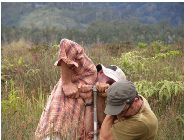
Figure 5. Core sampling at Kosipe swamp 100km north of Port Moresby in Papua New Guinea.

Palaeoecological research can thus provide baseline information on threatened plant and animal communities and the sensitivity to change of some of their individual species. It can contribute to vulnerability mapping and to planning for the maintenance or restoration of habitat connectivity. In specific cases it can provide a basis for attempts to reconstruct lost communities from completely altered island habitats. In the future high resolution studies of pollen, diatoms and geochemical proxies that link the Little Ice Age responses with current trends can provide a monitor of the on-ground effect of climate change.