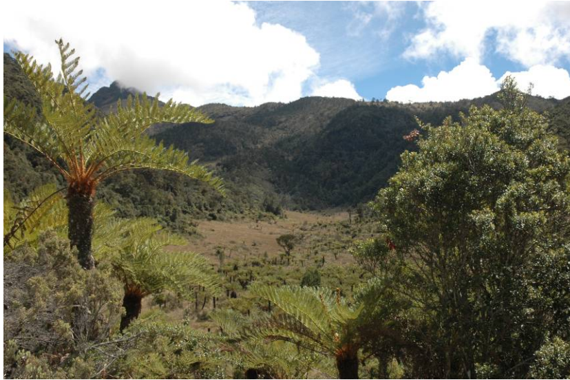
Figure 3. Secondary vegetation at 3250m on Mt Wilhelm, PNG. This has developed from forest in the last few centuries.