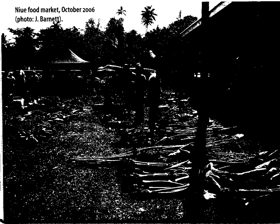
Niue food market, October 2006.

Increases in climate-driven storm damage may also impact on fisheries development through damage or loss of boats, boat launching and fuel facilities, and fish storage and processing facilities. So, through changes in fish habitats, migration patterns and fishing-related infrastructure, climate change presents significant risks to fisheries and to the people and islands that depend on them for food and income.