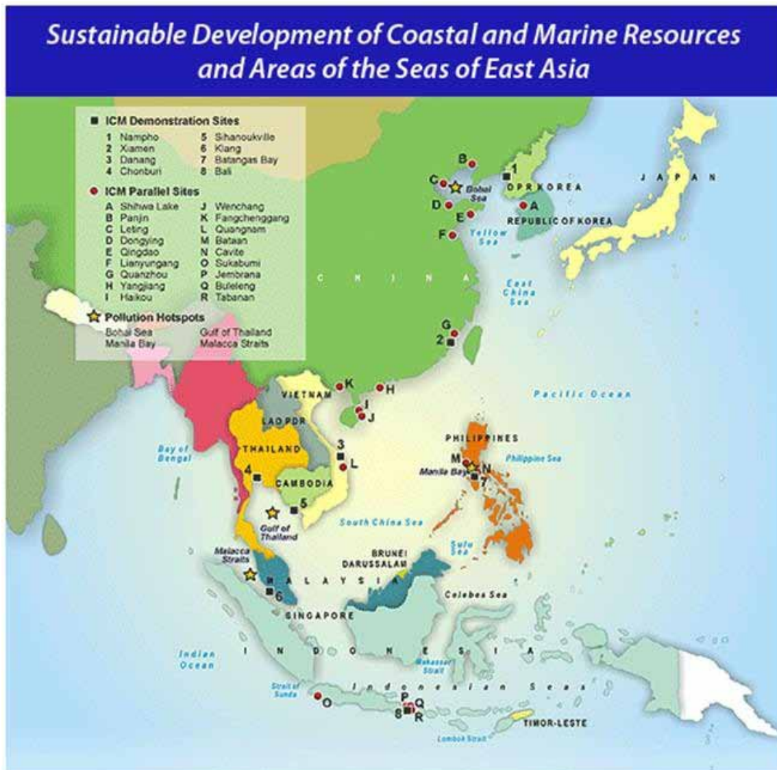
Figure 3 PEMSEA Sites for ICM