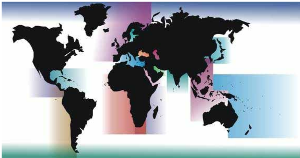
Fig. 2 Global distribution of regional seas (UNEP, 2005a)

Globally, the Regional Seas Programme has many partners for implementing MEAs and global programmes and initiatives. These partners in 2005 were: The Global Plan of Action (GPA) for the Protection of the Marine Environment from Land-based Activities, International Coral Reef Initiative (ICRI), WWF, International Maritime Organisation, Global Environment Facility, Intergovernmental Oceanographic Commission (IOC) of UNESCO, UN Food and Agriculture Organisation (FAO), International Atomic Energy Agency (IAEA), IUCN and the Small Islands Development States' (SIDS) Programme of Action.