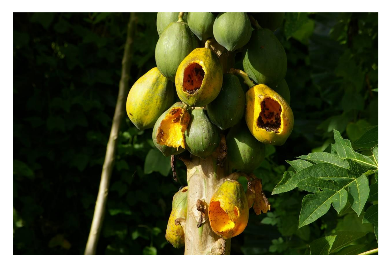
Common myna ( Acridotheres tristis ) damage to pawpaw ( Carica papaya ), Mangaia, Cook Islands.