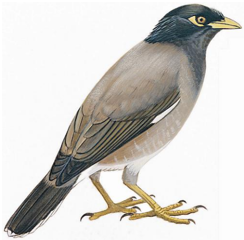
Common myna (Acridotheres tristis).

Common mynas are 25 cm in length, medium sized but heavily built with predominantly brown plumage. The head and breast are glossy black and the undertail coverts and tip of the tail are white (Feare et al. , 1999). The bill, legs and feet and a bare patch of skin around the eyes is yellow (Feare et al. , 1999). Common mynas are aggressive and said to be highly competitive. Less information is available for the jungle myna which is often mistaken for common myna. Watling (1975) concluded that the two species fill different places in habitats modified by man but share a wide ecological overlap.