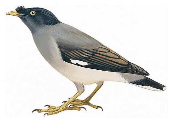
Jungle myna ( Acridotheres fuscus) a smaller (about 75%) and more secretive bird than the common myna. Little is known of the jungle myna.