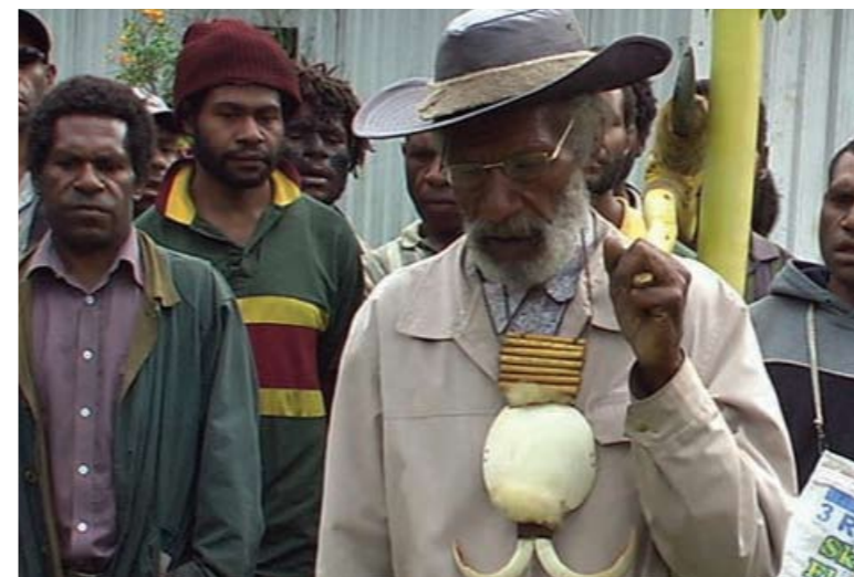
A PNG landowner making a statement at a meeting on carbon trading.

Therefore any 'informed' 60 decisions by indigenous landowners must be preceded by a considerable amount of awareness, information sharing, and participatory learning on a number of issues: the nature of climate change, greenhouse gases, the role of forests in providing environmental services including climate change mitigation, options for managing and gaining benefit from different forest values, carbon finance and carbon trading. Apart from a handful of 'elite' landowner representatives who live in the major cities and have had considerable interaction with government agencies, the carbon-brokers or NGOs, there has not been sufficient awareness and education provided to village-based landowners to meet an 'informed' test. On this issue alone, none of the forest carbon-