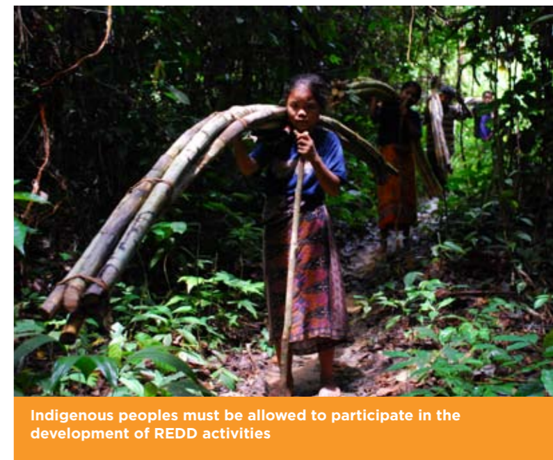
Indigenous peoples must be allowed to participate in the development of REDD activities

Meanwhile, intact natural forest that is maintained traditionally by indigenous peoples is in danger. The oil palm industry, together with the pulp and paper industry, are expanding rapidly and have been aggressively applying for concessions in natural forest and peat land, areas with the largest stores of carbon. By 2008, Indonesia – which has 83% of South-East Asian peat lands – had converted 19.8 million hectares of intact natural forest into oil palm and 27.71 million