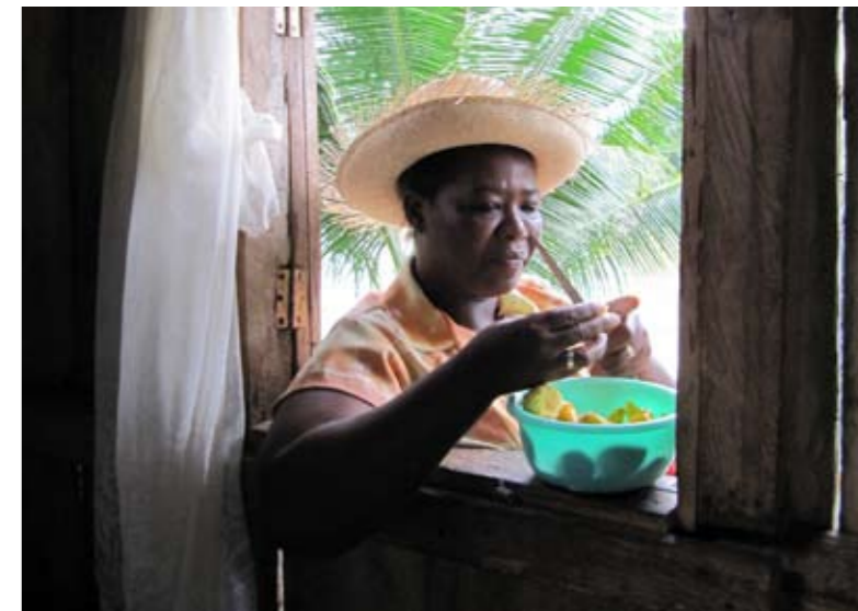
Woman preparing chonta palm for lunch: Esmeraldas, Coastal region, Ecuador

The experience with Socio Bosque and other government policies indicates the need for more effective participation from stakeholders. This requires not just better dissemination of information about the policies adopted, but also the analysis of proposals and demands from the indigenous movement and civil society and