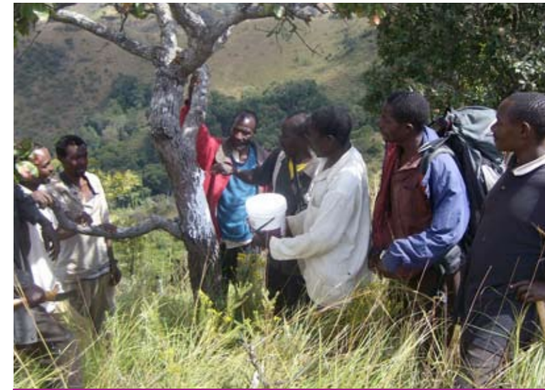
Communities protecting forests, Tanzania

The deforestation rate is approximately 1.2 % per year, with Tanzania losing approximately 412,000 hectares of forest annually, mostly from forests on village land. Annual rates of deforestation in some