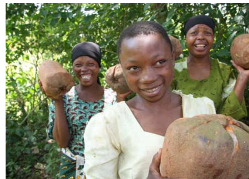
The fruits of community forests in Tanzania

Ultimately the UNFCCC is a climate convention, not a carbon convention. While forests play a crucial role in carbon sequestration, they also affect climate in other ways. They play an important role in regulating ground water and rainfall, and thereby influence the climate in areas far beyond the forests themselves. Forests also lessen the impact of natural disasters, for instance by functioning as physical barriers against heavy winds and landslides. Intact natural forests sequester more carbon than other forest