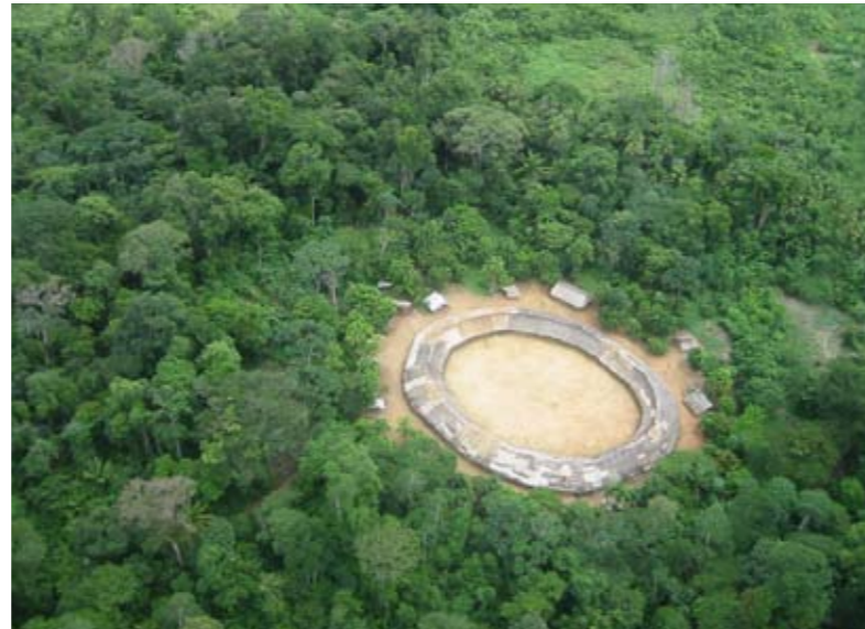
Demini village, Yanomami people in Amazonas

The principal drivers of deforestation are broadly the same throughout the Amazon: farming and ranching, timber extraction, land-grabbing, and infrastructure projects. The devastation follows a well-known pattern: (1) timber companies clear roads branching off highways toward locations with valuable trees, often in protected areas or riparian communities; (2) these companies exhaust the supply of prime timber species and move toward new fronts; (3) using the newly opened roads, land-grabbers and ranchers