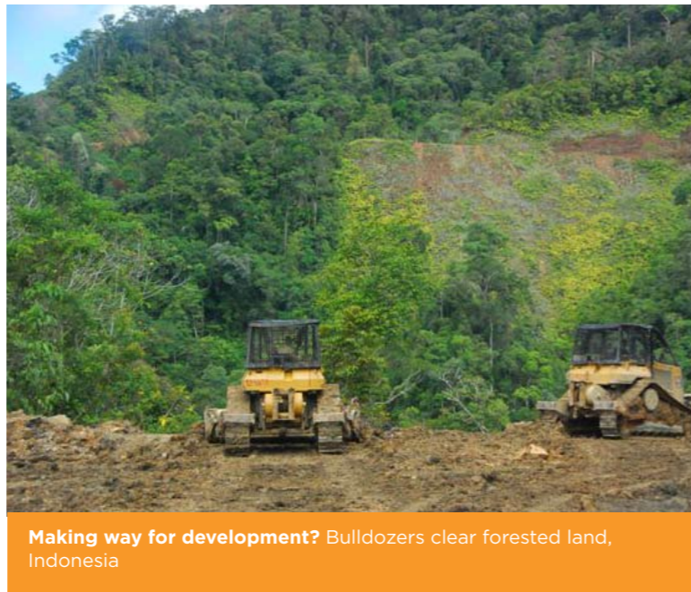
Making way for development? Bulldozers clear forested land, Indonesia

The most crucial concept in the Basic Forestry Law is state forest, whereby the state had exclusive authority over all aspects of human activity within any territories classified as state forest zone ( kawasan hutan ). To strengthen state control over the vast area of forest, and to facilitate the allocation of concessions, the government embarked on a series of mapping exercises. These culminated in 1980, when each provincial governor prepared a Consensus Forest Land Use Plan (Tata Guna Hutan Kesepakatan or TGHK). The TGHK classified 143.8 million hectares (approximately 75% of the nation's land area) as 'forest land' which subsequently came under the jurisdiction of the Ministry of Forestry, and divided into a number of management