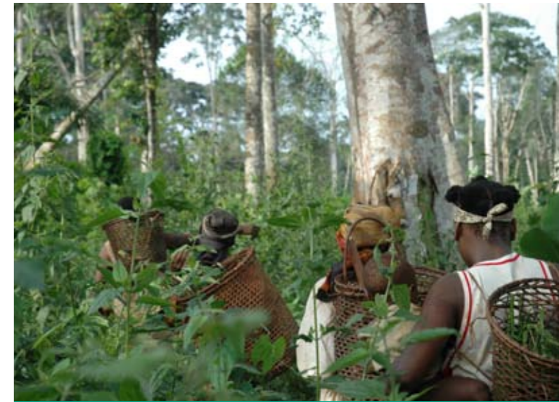
Another trip to the supermarket: women gathering non-timber forest products in Cameroon

The forest-dwelling communities in Cameroon include the Bantus or semi Bantus, who are mainly traditional swidden agriculturists, and the indigenous forest peoples often referred to as