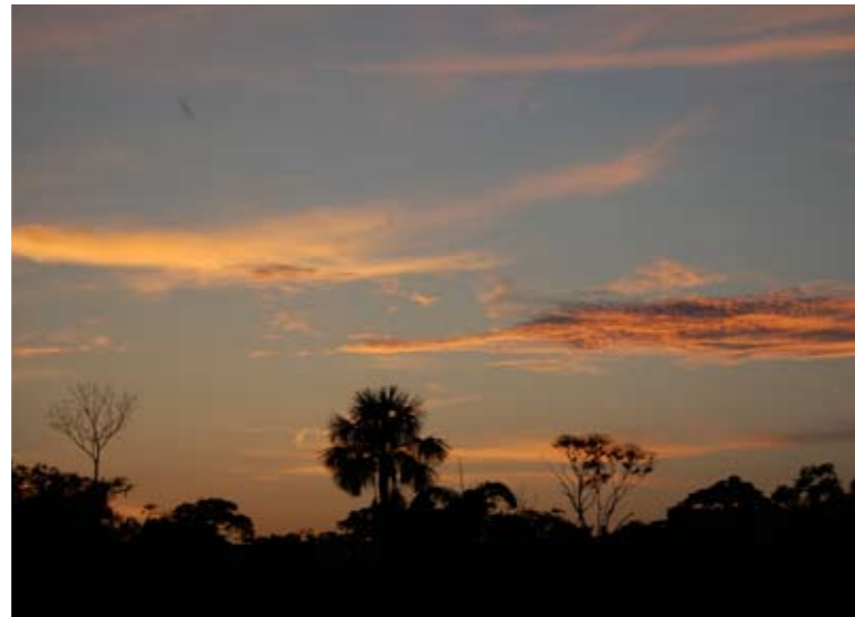
Sunset in Curaray: Amazon region, Ecuador

Although there is still high forest cover in Ecuador, it has one of the highest deforestation rates in the world, at 1.47% (198,000 ha/year). This has a major impact on biodiversity and people's livelihoods, and produces around 55