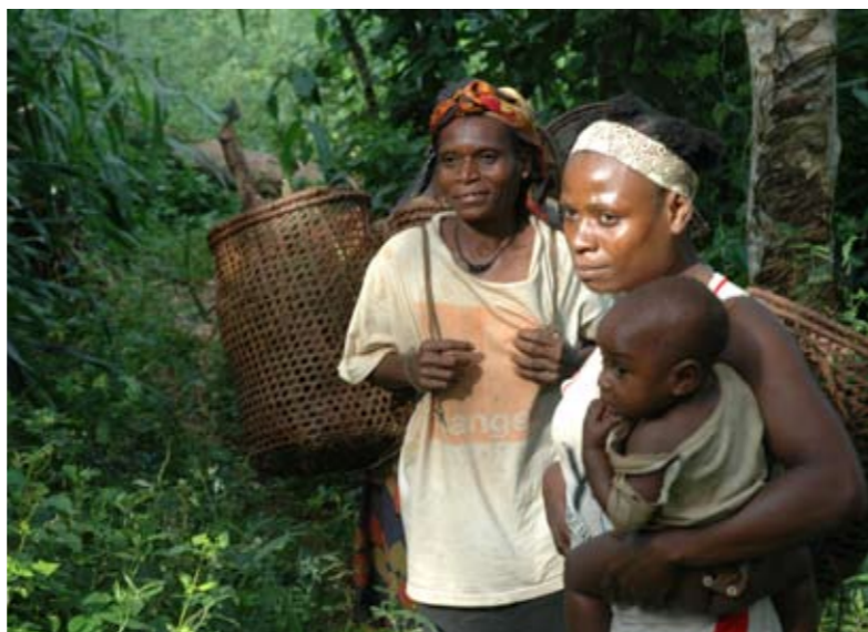
What benefits will we see? Insecure rights mean an uncertain future

Most forest people gain access to state-held land through local or customary systems of resource tenure. These systems vary considerably along the different ecological and socio-economic contexts of the country. In the forest zones of Cameroon, the two main groups, agriculturists and hunter-gatherers, have different perceptions of ownership. For the Bantus or agriculturists, land belongs to a lineage, and individuals within the lineage have rights to clear and cultivate the land. In general, agricultural land ownership for the Bantu in southern Cameroon is based on the 'right of the axe', or droit d'hache , 54 that is the acquisition of land through the cutting or clearing of an area in the forest. The space cleared is then defined as belonging to the individual or group that did the clearing, and their descendants.