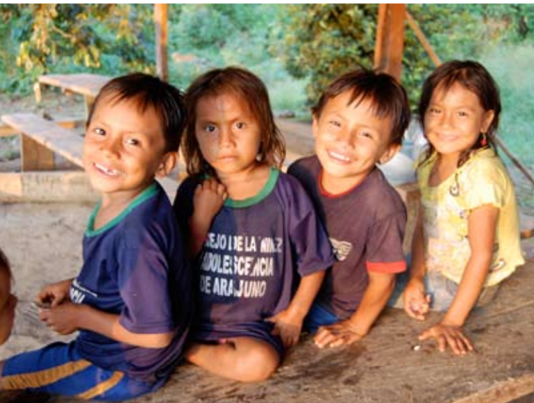
Kichwa Children of Curaray: Amazon region, Ecuador

“Ultimately, participation implies the right that indigenous peoples and forest-dwellers have to decide, in an informed manner and on their own terms, whether or not to participate in REDD+.”