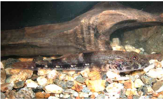
Glossogobius sp., Basilaki Island