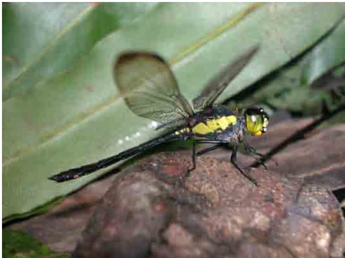
Anisoptera sp. 2, Sariba Island