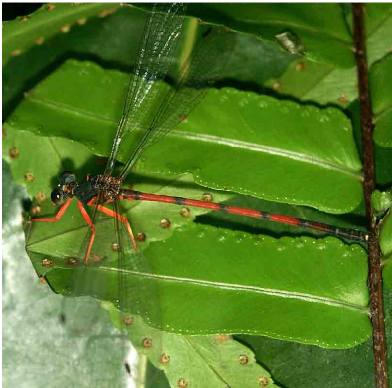
Argiolestes new sp. found during the present C.I. funded survey on waterfall faces and seeping banks at Sariba Island, pictured on the right.