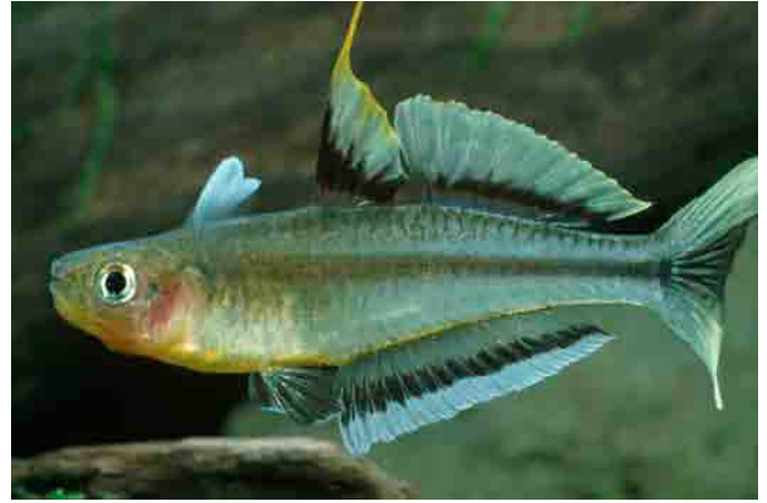
Pseudomugil connieae , Popondetta area