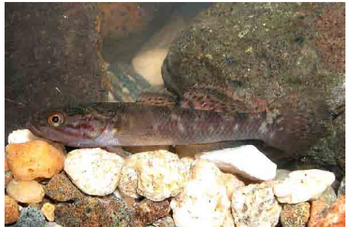
Mogurnda sp., Sideia Island