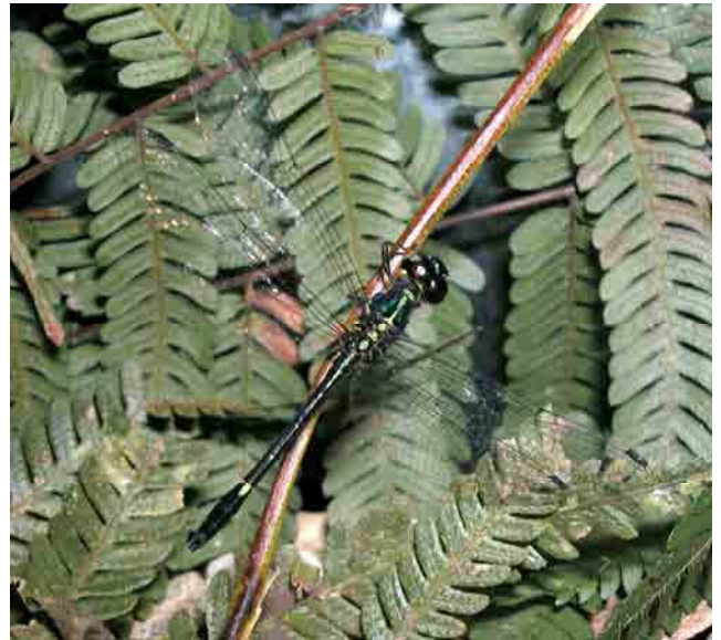
Anisoptera sp. 3, Sariba Island