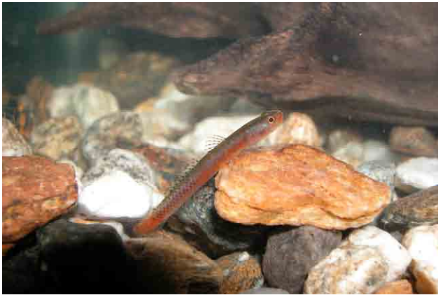
Stiphodon birdsong , Basilaki Island