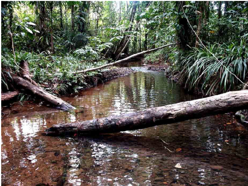
Alluvial lowland swamp forests near Suloga Harbor, Woodlark Island, habitat of the very rare Mortonagrion martini