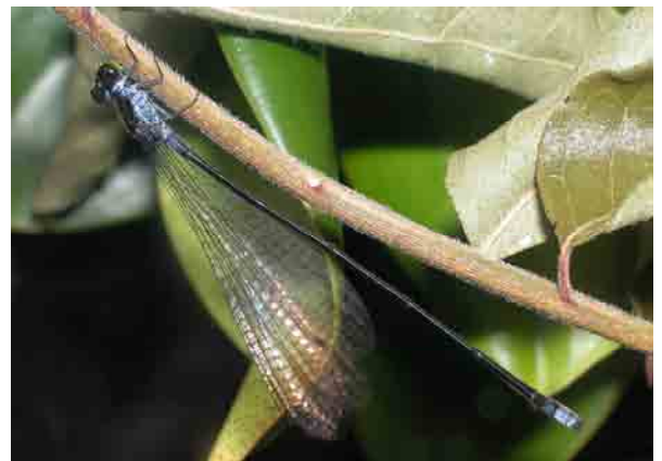
New species of amber-winged damselfly, Sideia Island