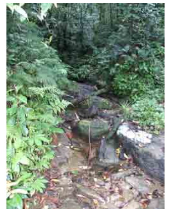
Small streamlet, Normanby Island