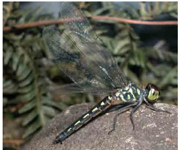
Anisoptera sp. 1, female, Tubetube Island