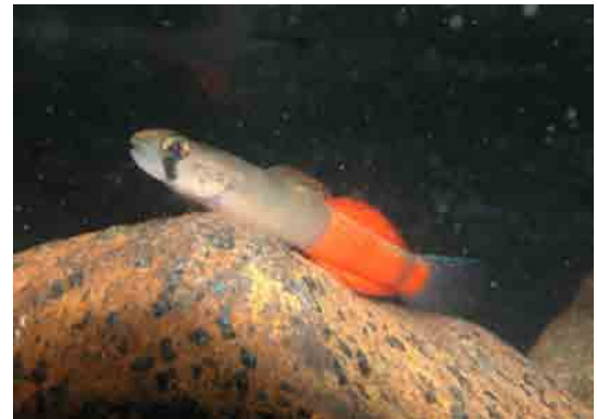
Sicyopus nr. zoesterophorum , Basilaki Island