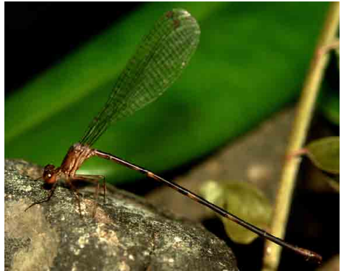
Idiocnemus zebrina , female, Sariba Island