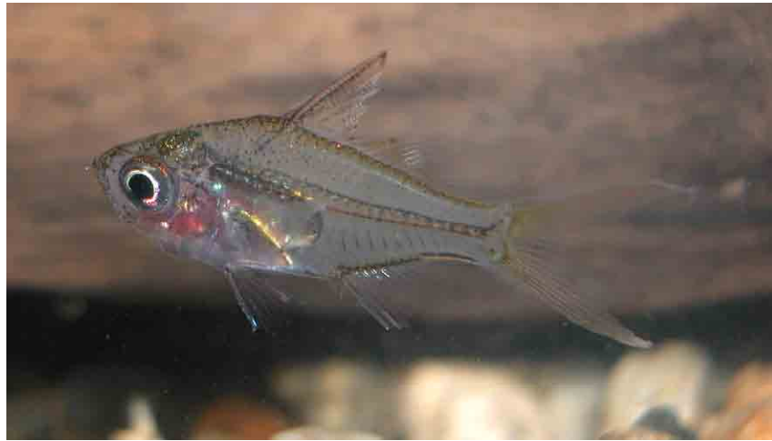
Ambassis sp., Sideia Island