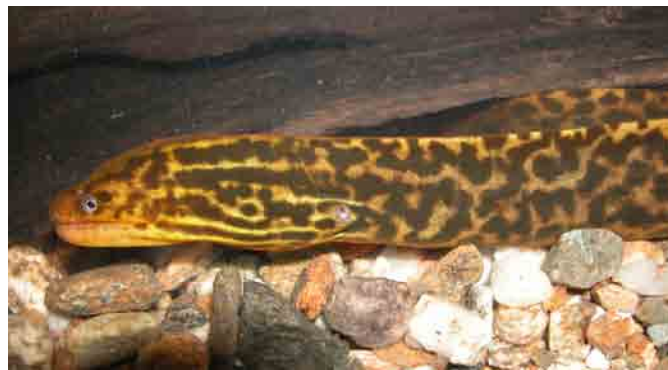
Freshwater eel, Gymnothorax polyuranodon , Basilaki Island