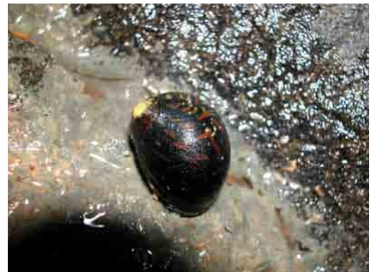
Neritina turtoni , Sideia Island