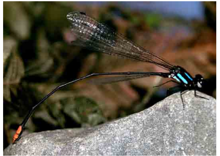
Nososticta finisterre , Sariba Island