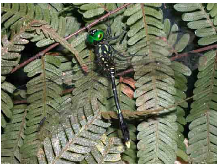
Anisoptera sp. 4, Basilaki Island