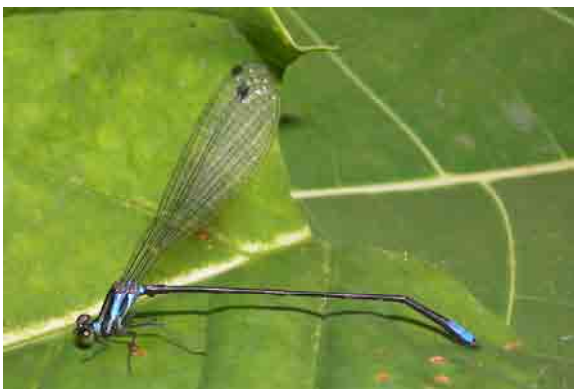
Idiocnemus inaequidens , near Tufi