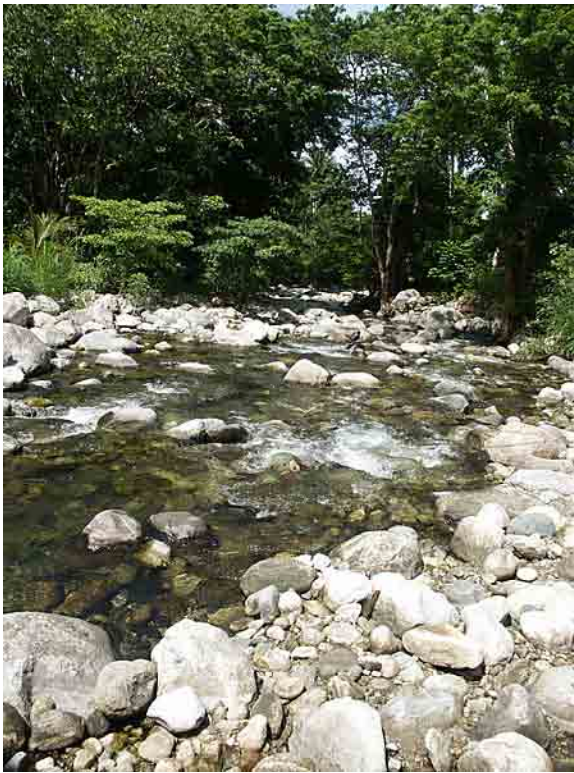
Awaetowa River Fergusson Island, D'Entrecasteaux Islands