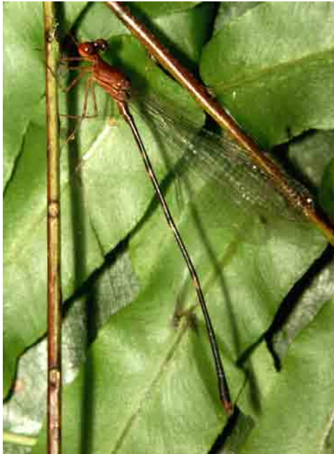
Idiocnemus zebrina , male, Sariba Island