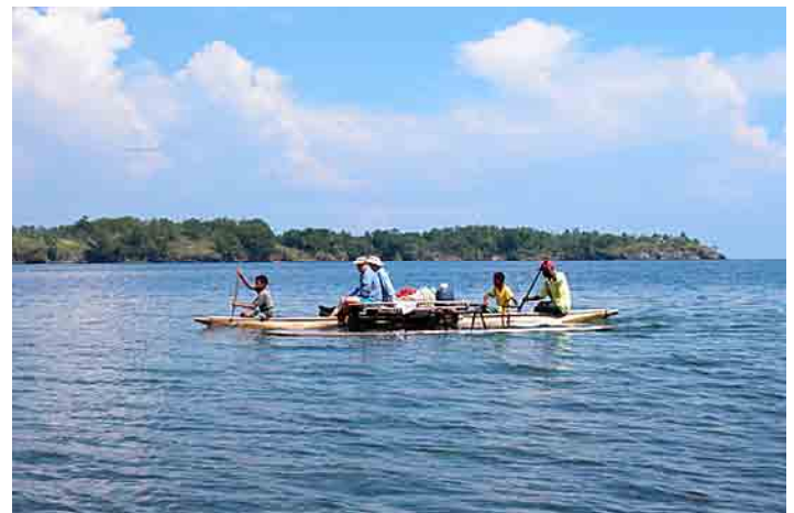
Paddling to sample stream estuary near Tufi