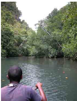
Pristine mangrove estuary, Tufi