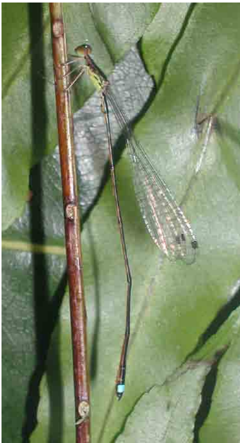
Tanymecosticta leptalea , Sariba Island