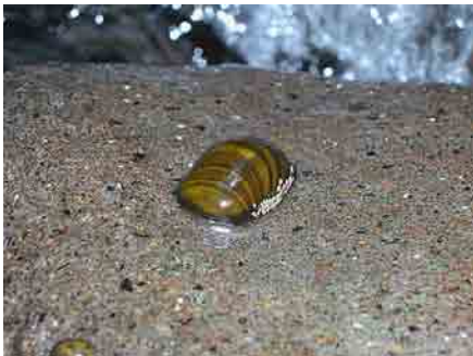
Native freshwater snail (Neritidae) in stream near Tufi

Area 40. Woodlark Island - An isolated island composed primarily of an elevated limestone surface with scattered higher ranges of hills formed from emergent metamorphic bedrock. No endemic fishes are known from the island, but it does support endemic species of aquatic Heteroptera and Odonata.