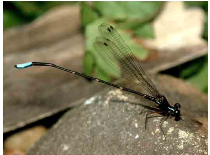
Drepansticta conica , Basilaki Island