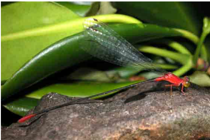
Teinobasis rufithorax , male, Tubetube Island