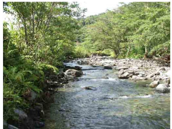
Dibuwa River, Normanby Island, D'Entrecasteaux Islands