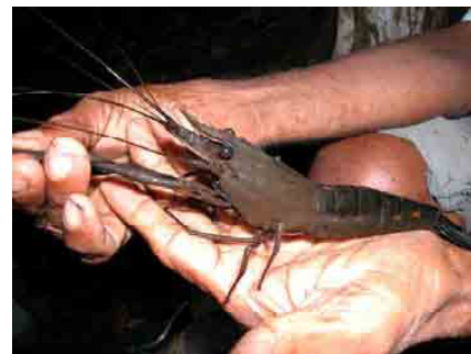
Macrobrachium lar from streams on Sideia Island