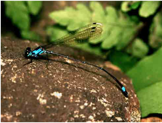
Nososticta salomonis , Sideia Island