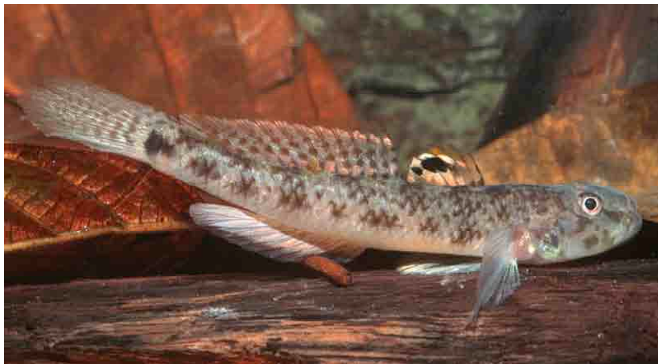
Glossogobius hoesei , Vogelkop Highland lakes