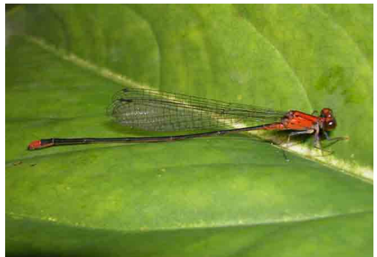
Pseudagrion n. sp., Kofure Stream, Tufi