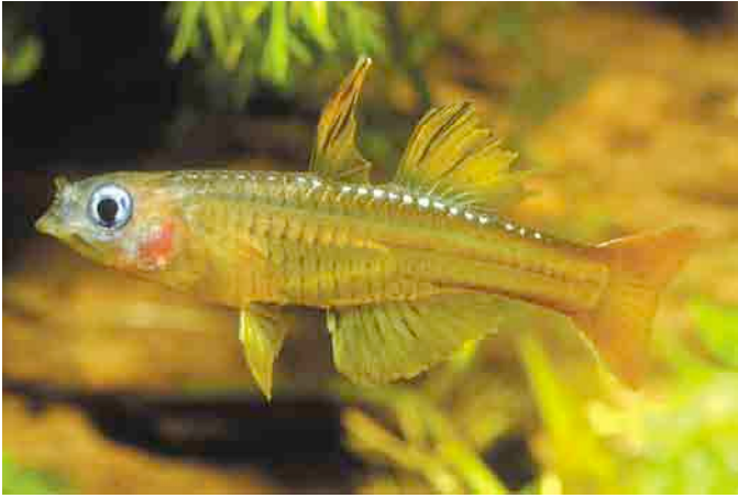
Pseudomugil ivantsoffi , Arafura Foreland