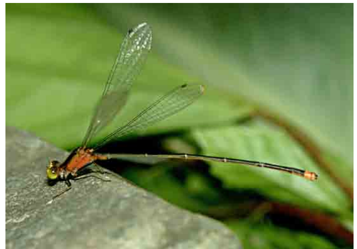
Pseudagrion silaceum , Gumini River, Alotau