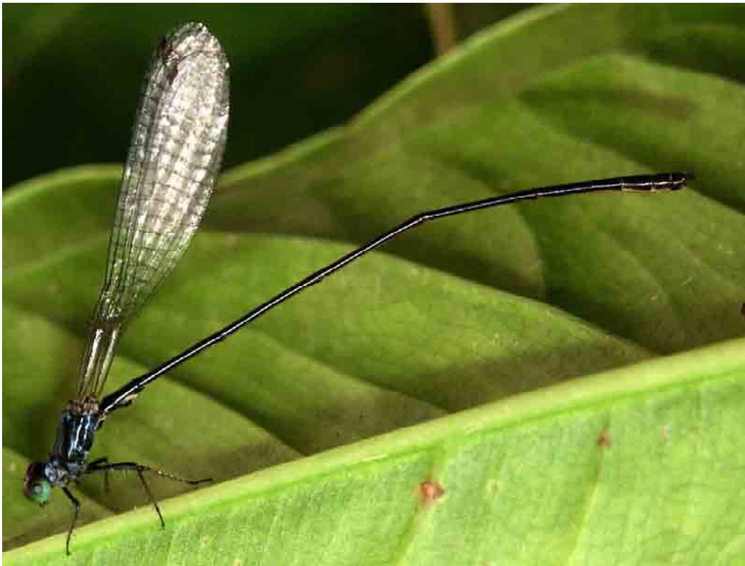
Teinobasis dolabrata Liefteinck found in coastal swamp forests draining the Huon Gulf, such as the Kofure River near Tufi