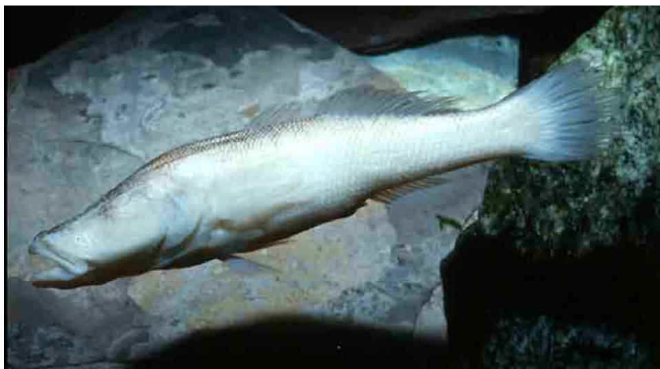
Oxyeleotris caeca , a blind cave fish found in a limestone sinkhole near Kafka, Kikori River Basin, Papuan Gulf Foreland