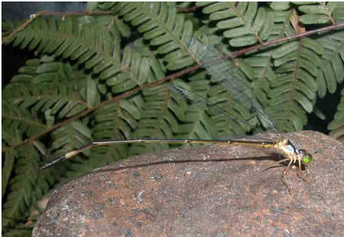
Unknown damselfly, Basilaki Island