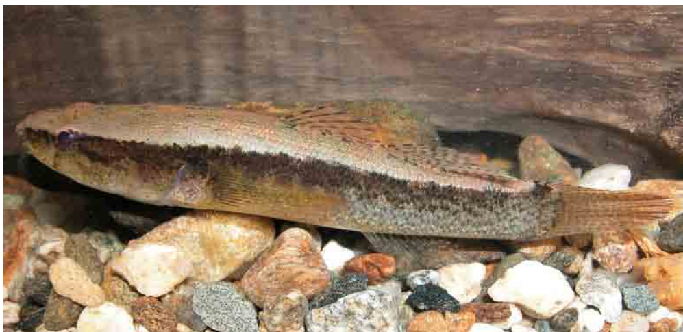
Eleotris sp., Basilaki Island