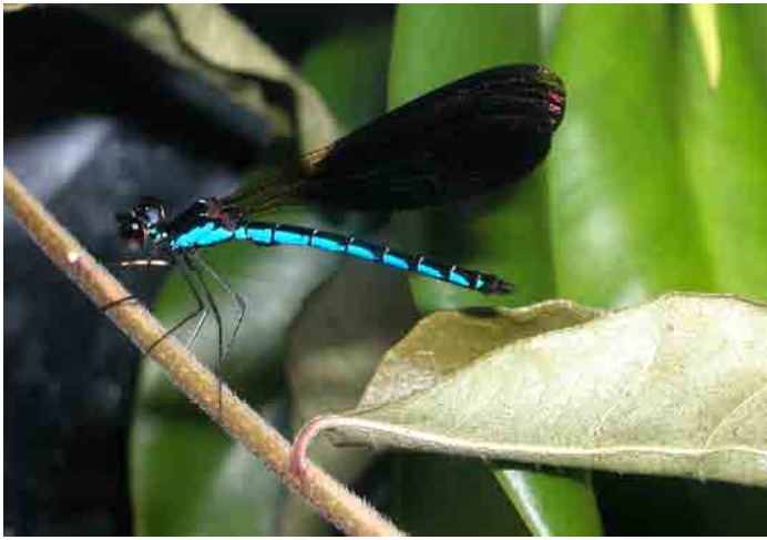
Rhinocypha tincta , Sideia Island