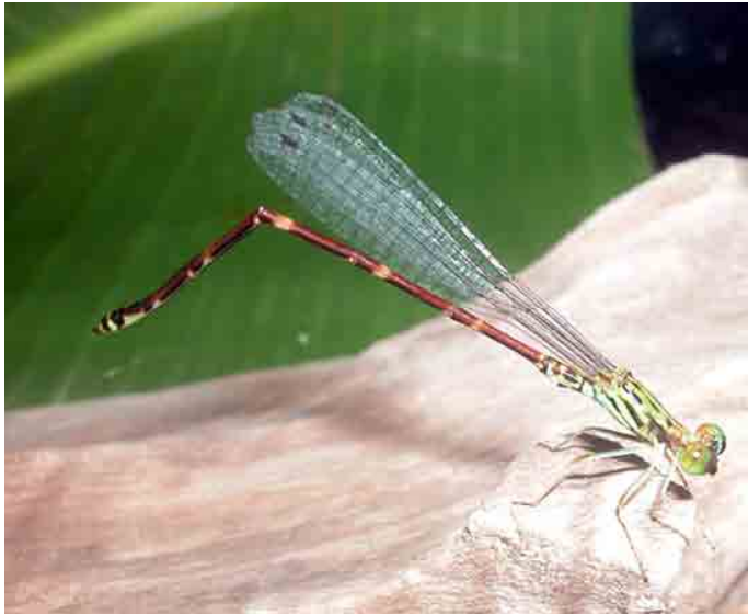
Selysneuria n. sp. 1, Gumini Stream, Alotau