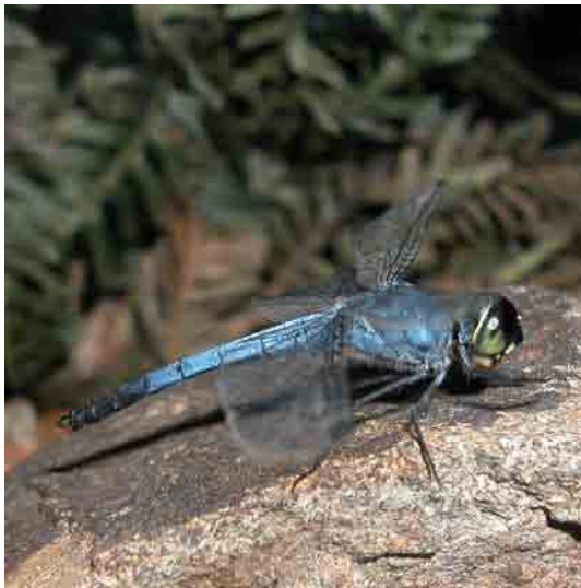
Anisoptera sp. 1, male, Tubetube Island