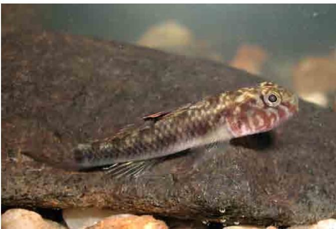
Redigobius sp., Sideia Island