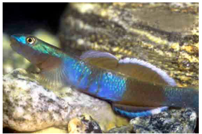
New Lentipes species, male, Goodenough Island