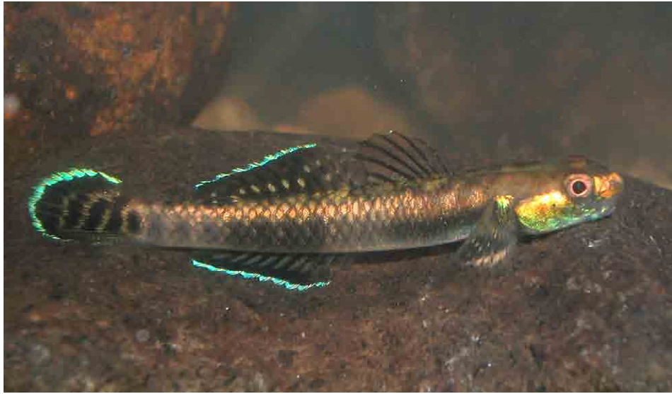
Stiphodon sp., Sideia Island