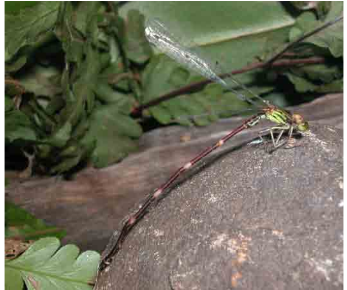
Selysneuria raphia , Basilaki Island