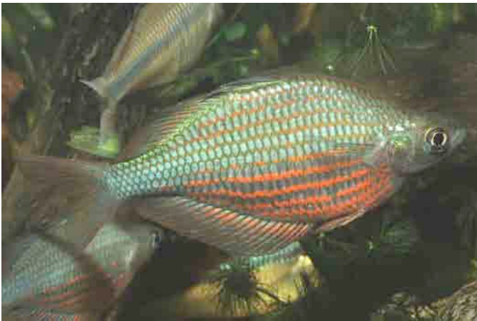
Glossolepis dorityi , Northwest Papuan Coastal Lowlands