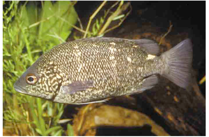
Hephaestus habbemai , Arafura Foreland