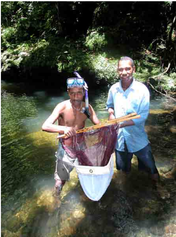
Sampling near Tufi