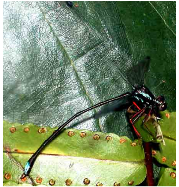
Argiolestes annulipes , Sariba Island