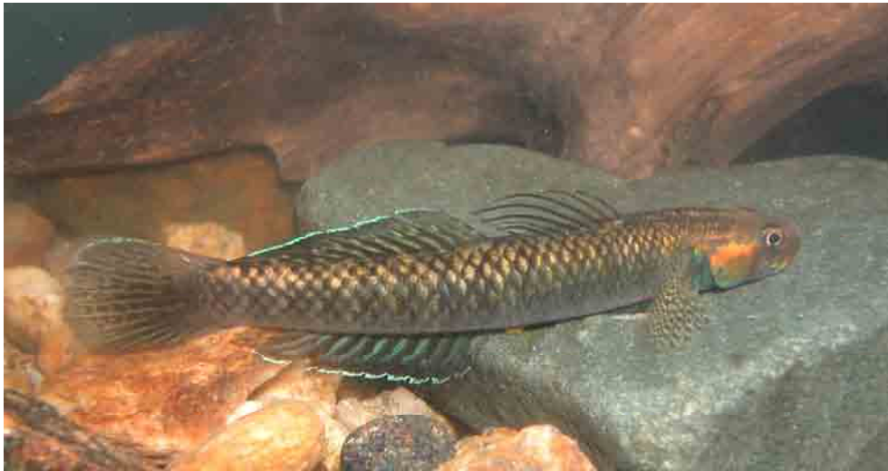
Stiphodon sp., Basilaki Island