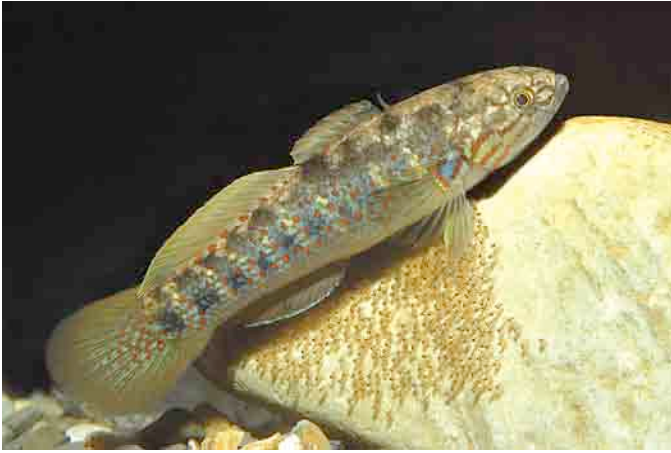
Mogurnda cingulata , Arafura Foreland