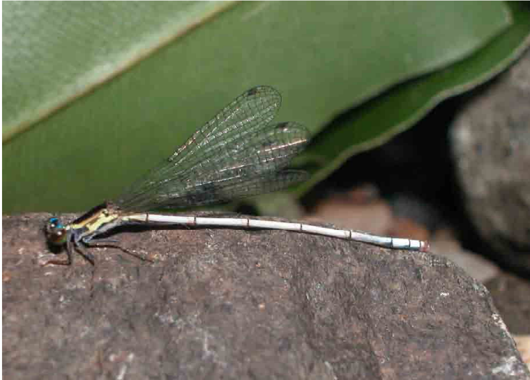
Mortonagrion martini (Ris) found in lowland swamp forests near the coast, Sideia Island