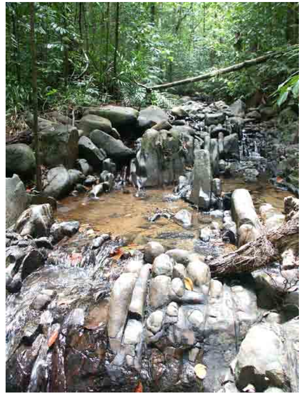
Stream habitat Woodlark Island