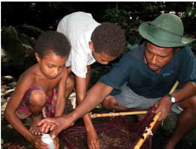
Collecting aquatic biota on Sariba Island, Milne Bay

The approach of defining areas of endemism on the basis of congruent species distributions was used in a previous report dealing with Sulawesi (Polhemus and Polhemus, 1990). In that study it was found that the single island of Sulawesi could be viewed as at least five separate islands in terms of the distribution of its freshwater biota. The situation in New Guinea is similar but even more complex, and complicated to a degree by the island's large size and complex history of geological assembly, coupled with a continuing absence of faunal survey data from many key regions. As a result it has been difficult to ascertain the definitive contact zones between many of the areas of endemism defined herein, and the boundaries depicted on Map 1 in particular should be viewed as speculative in many cases, and open to further refinement as more detailed distributional data becomes available.