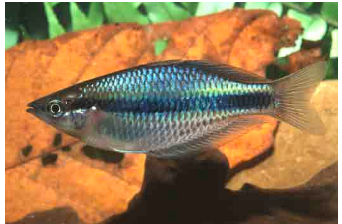
Melanotaenia catherinae , Raja Ampat Islands