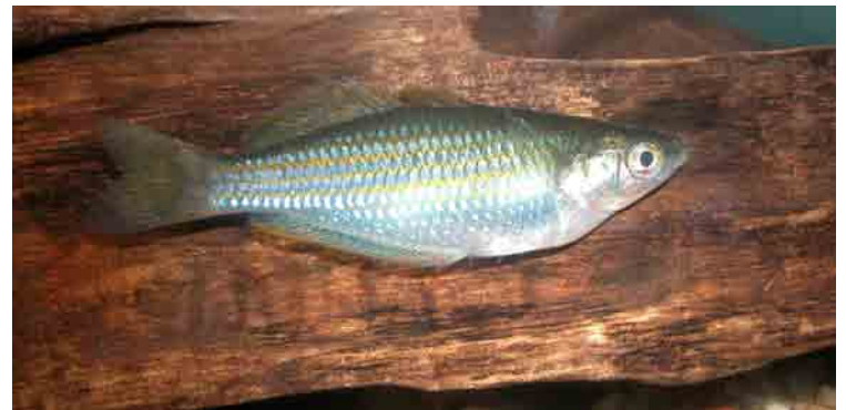
Melanotaenia sp., Gumini River near Alotau