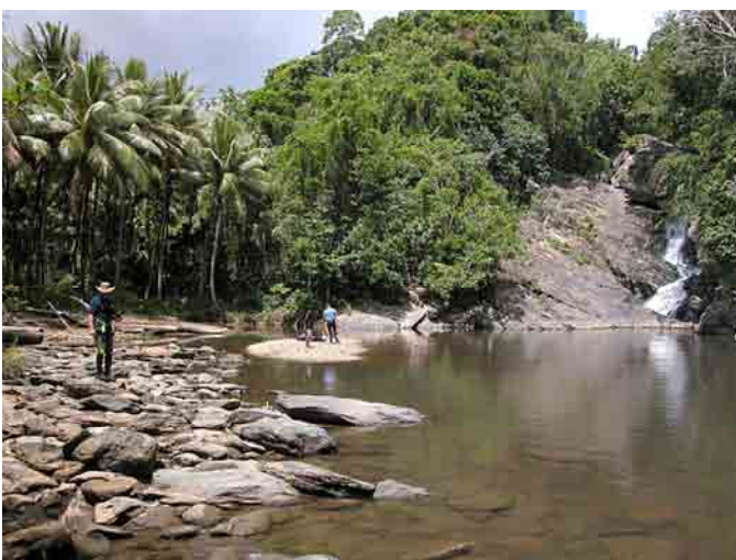
Kolukolu Creek estuary, Tagula Island, Louisiade Archipelago