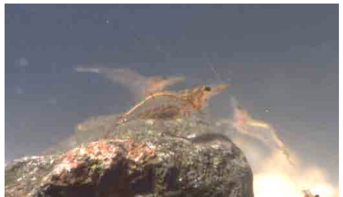
Macrobrachium grandimanus , Sideia Island