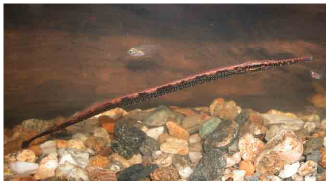
Microphis brachyurus , Sideia Island