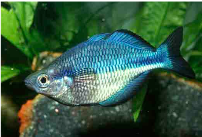
Melanotaenia lacustris , Lake Kutubu