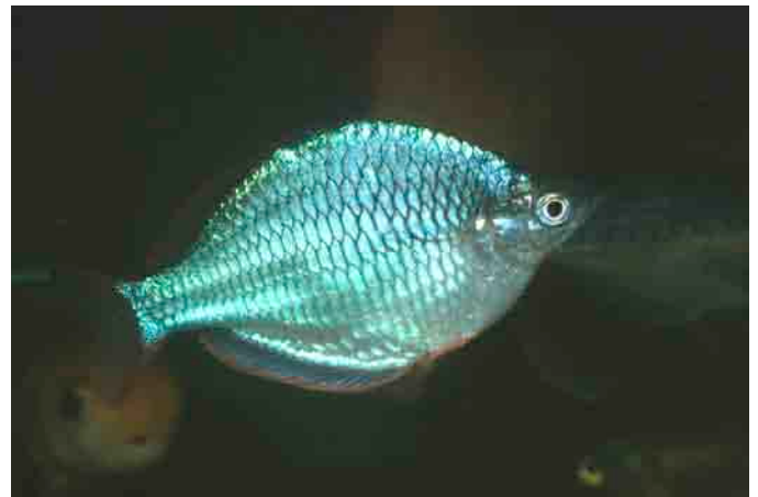
Melanotaenia praecox , Mamberamo Foreland