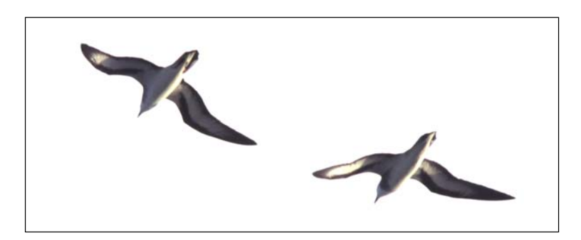
Figure 3. Black-winged petrels in courtship flight