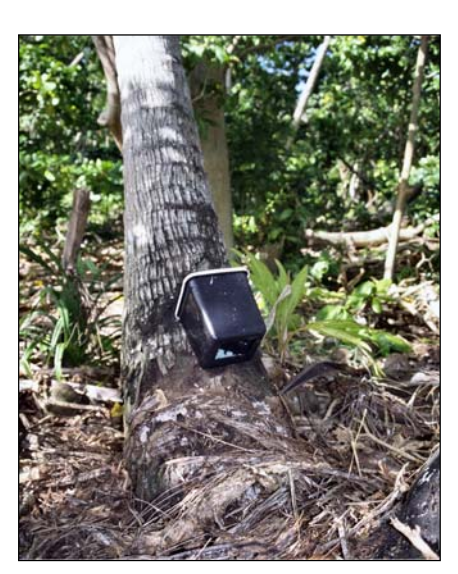
Figure 2. Bait station

The baits used were 2g Pestoff rodent bait 20R pellets containing 0.002% Brodifacoum and supplied by Animal Control Products Ltd, Wanganui, New Zealand. The baits used were from the same shipment sent to Tonga in June and 50 baits were placed in each station per day. Any wet or soiled baits were replaced daily and all baits were completely replaced every three days during the first 10 days of the operation and every four days thereafter – weather permitting.