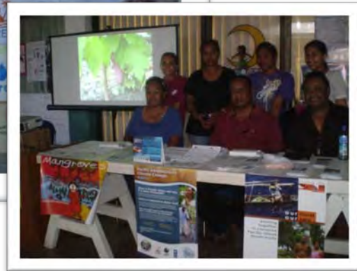
Community Outreaches, World Water Day