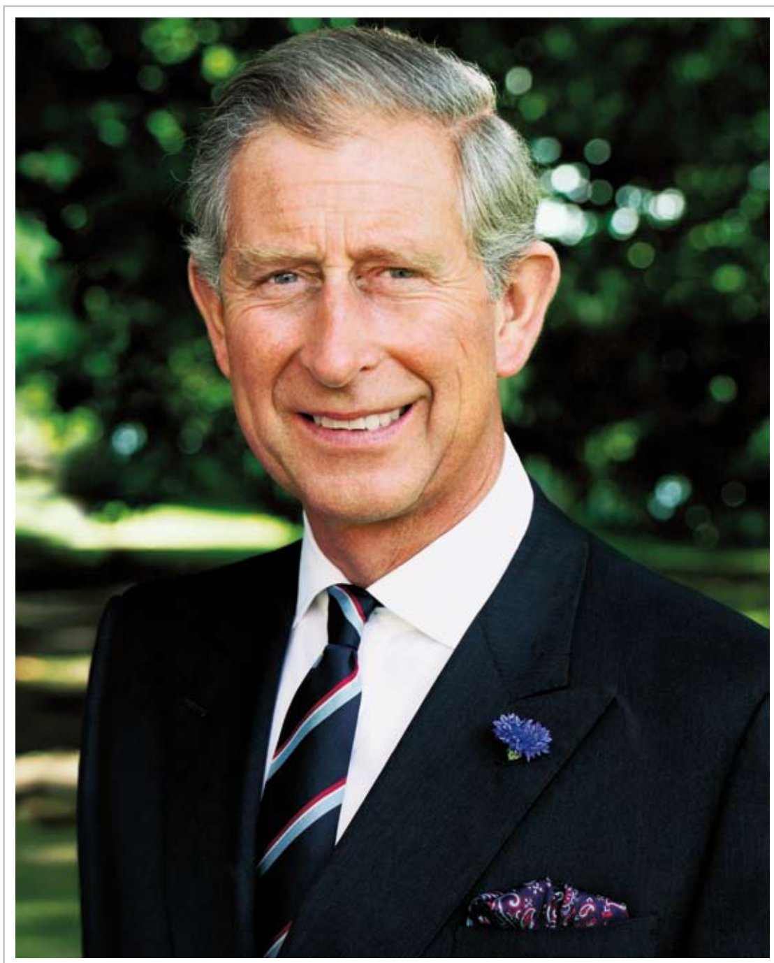
His Royal Highness The Prince of Wales