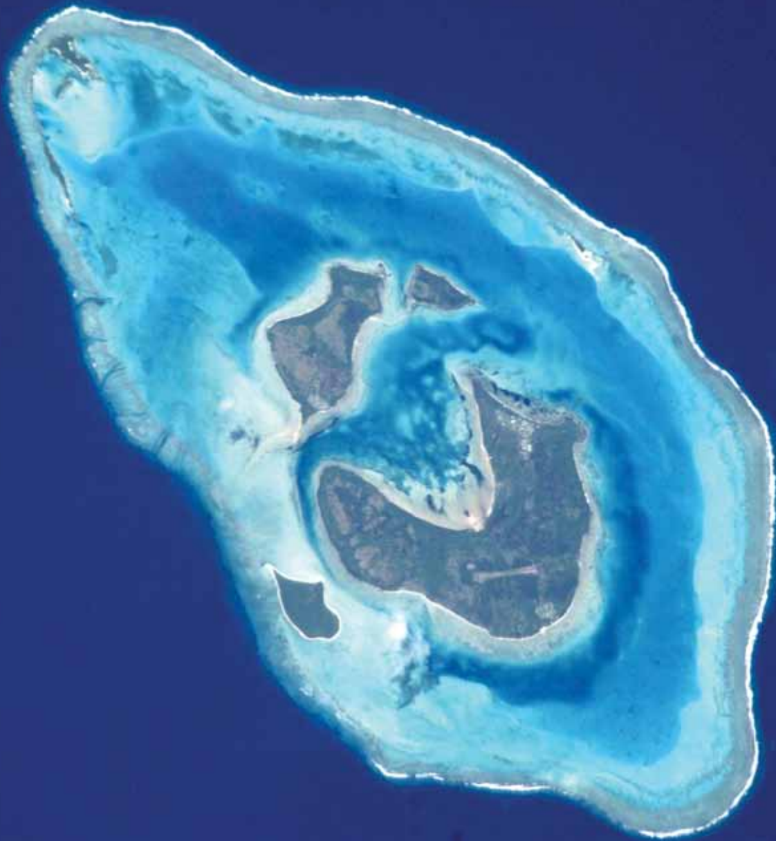
Ono-i-Lau, a volcanic and coral island in Fiji's Lau archipelago. Photo © NASA. Source: Wikipedia. http://eol.jsc.nasa.gov/scripts/sseop/photo.pl?