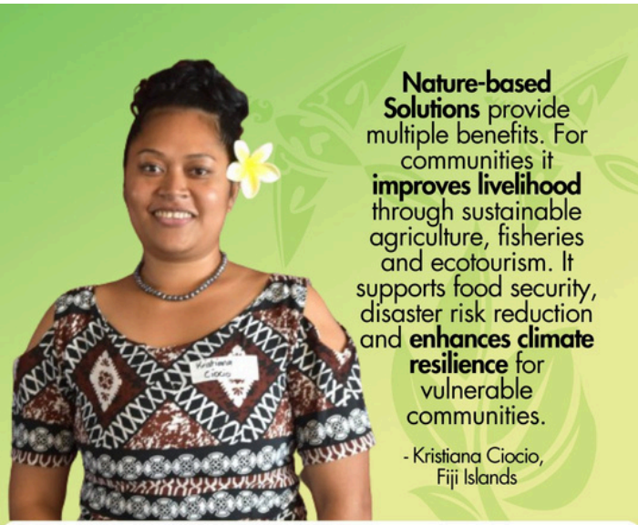
Aligning Nature-based Solutions & Ecosystem-based Adaptation Workshop Suva, Fiji | 20 - 21 August 2024

How can we harness the power of nature to help solve development sustainability issues in the face of climate change impacts? How can we ensure that our Nature-based Solutions projects and initiatives will have lasting positive socio-economic impacts while achieving long-term positive change in the health of our natural ecosystems and biodiversity? Pacific participants at the 'Aligning Ecosystem-based Adaptation and Nature-based Solutions in Fiji' from 20 - 21 August, explored and improved their understanding on the convergence of NbS and Ecosystem-based Adaptation projects and how they can be best applied to support sustainable development. The workshop was a collaboration between SPREP's BIEM Initiative, which is a component of the Pacific-European Union Marine Partnership (PEUMP) Programme funded by the European Union and the Government of Sweden; the multi-partner PPIN project, funded by NZMFAT, and the Pacific Ecosystem Based Adaptation to Climate Change (PEBACC+) phase 2 project funded by the Kiwa Secretariat and the French Facility for Global Environment