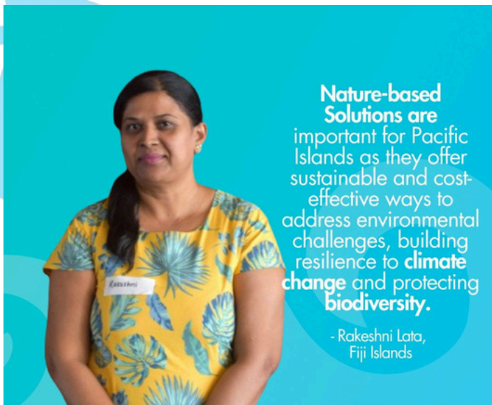
Aligning Nature-based Solutions & Ecosystem-based Adaptation Workshop Suva, Fiji | 20 - 21 August 2024