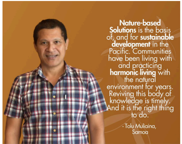
Aligning Nature-based Solutions & Ecosystem-based Adaptation Workshop Suva, Fiji | 20 - 21 August 2024