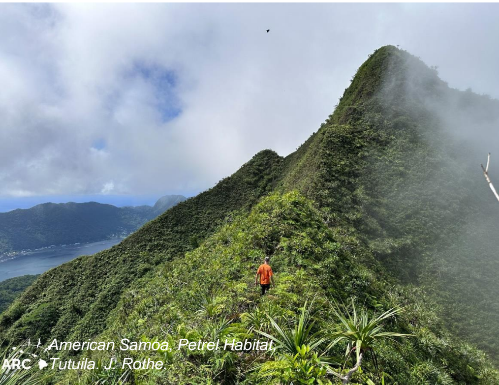
American Samoa, Petrel Habitat ARC ▶ Tutuila