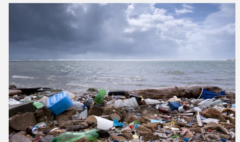
Figure 6: Plastic rubbish scattered along beach.

Scale. PRTs cannot scale up to the rapidly increasing scale and complexity of the plastics crisis. Worldwide, coastlines cover hundreds of thousands of kilometres. The ocean has a water volume of 1.37 billion km 3 covering 361 million km 2 , and rivers stretch over an area of 773,000 km 2 . The Pacific Island region alone includes 30,000 islands and 15 countries scattered across 165.25 million square kilometres (ca. 33% of the Earth's surface). No PRTs have been evaluated for their removal efficiency 1 .