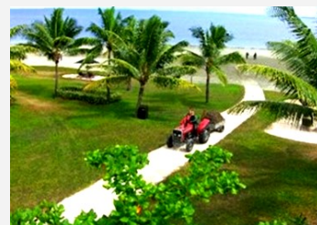
Figure 1: Hilton Fiji Beach Resort and Spa-Denarau_Island_Viti_Levu.html Ironically, award-winning beaches are subject to more grooming and thus lower biodiversity.

Beach grooming involves the use of tractors or robots to rake or sieve the sand to remove plastic debris. It can alter beach habitats, reduce biodiversity, and destroy plants and invertebrates. When plastics are removed, plant debris (food and habitat for many animals) can also be removed.