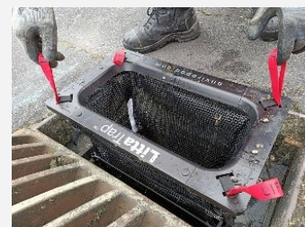
Figure 3: Litta Trap™

Rivers. Forty types of PRTs are used in rivers and estuaries including booms, watercraft vehicles, bubble curtains, or receptacles 3 . Most also remove organisms and natural flotsam, important habitats for organisms. Many PRTs target the river surface missing plastics at depth. Devices at river mouths do not remove plastics from rivers themselves. One study estimated the efficiency of river barriers to reduce plastic outflow to the ocean at 54%. Thousands of rivers would need PRTs to have a significant impact 7 . Stormwater traps (e.g., LittaTraps™) capture plastics closer to the point of release.