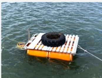
Figure 2: "Seabin mounted to a pontoon and anchored down to a fixed location at the University of the South Pacific, Marine Studies campus jetty".

Seabins™ are used in many harbours to trap floating trash. Two scientific evaluations in the UK and in Fiji showed that they capture small amounts of plastic (0.0059 kg per day) but many plants and animals 4,5 . For every four pieces of plastic, the Seabin would catch one organism, and almost three quarters were dead after two days 4 . 500 Seabins™ would need to run continuously to keep even a small harbour free of floating plastics 4 . Their maintenance costs are orders of magnitude higher than those of manual cleaning 4 .