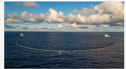
Figure 4: TOC uses a net towed by two ships for up to two weeks to capture macroplastics

Ocean surface. Ocean surface cleanups were popularized by The Ocean Cleanup® (TOC). TOC uses a net towed by two ships for up to two weeks to capture macroplastics. This results in significant bycatch, killing many surface organisms central to the functioning of food-limited ecosystems. A single device running for one year could impact 675 tons of zooplankton 2 . In 2022, TOC caught over 667 kg of bycatch including sea turtles 9 . The floating plastics that TOC could collect are only a fraction of the plastics in the ocean. 200 TOC devices running for 130 years would only capture 5% of the world's floating plastics 6 and release significant amounts of CO 2 .