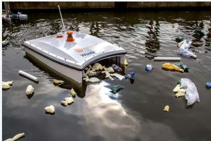
Figure 5: Robotic systems to clean ocean waste.

Seafloor. Much of the plastics in the ocean accumulates on the seafloor. Recent EU-projects aim to remove plastics from the seafloor using autonomous vehicles, robotic systems, and artificial intelligence 1 . Such complex systems will be costly and it is questionable if they will ever be technically mature. Trawling for plastics, like bottom fishing, is likely associated with high bycatch mortality and damage to habitats. Fishing-for-Litter initiatives, in which fishers collect plastic debris during fishing operations, can reduce plastics on the seafloor at low additional effort and inspire behavioural change 10 . Manual collection by divers comes with health and safety risks and is limited in scale.