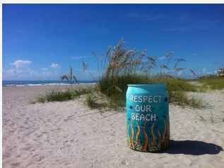
Figure 7: Creative Cans in the Sand, will help clean up the growing trash problem on the beach. Source: https://www.pinterest.com/pin/357473289146481223

Reuse, recycling, and disposal. Plastics collected using PRT or manual cleanups can almost never be reused nor recycled: over 13,000 chemicals are known to be used in plastics production, a quarter of which are categorized hazardous 11 . Plastics also attract other environmental pollutants once they are in nature and are subject to weathering 12 . In places like the large ocean small island developing states of the Pacific region (the safe and sustainable disposal of collected plastics presents significant challenges due to limited land for landfills and options for the safe disposal of hazardous materials. The best option is prevention coupled with removal of plastic out of the region before it becomes a persistent environmental and biological hazard.