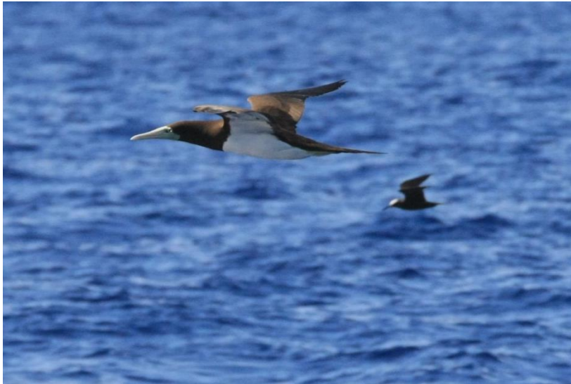
Figure 2. Brown booby and black nody, Apolima Strait.

At our first chumming station, a sea mount about 25kms SW of Apolima Strait, we attracted few birds over 3 hours, except for two wedge-tailed shearwaters late in the session. Certainly, no petrels or storm petrels - our target birds.