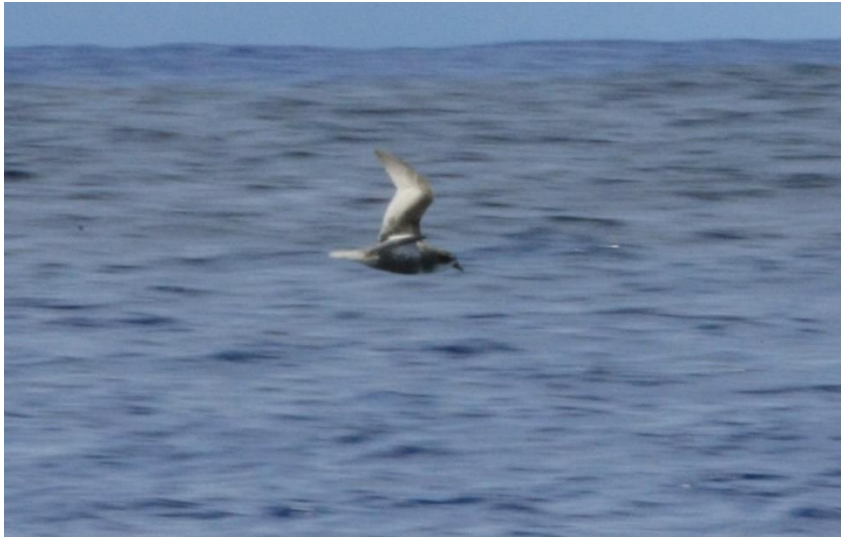
Figure 3. Mottled petrel, east of Upolu.

Also, there were good numbers of wedge-tailed shearwaters, most moving with the same flow, so could be from Tonga or Kermadecs to the south of Samoa. But also, possibly from Samoa itself. However, while chumming, our target species remained elusive. All the time, until some mighty rain squalls hit, we could see the jagged peaks of Tutuila, American Samoa in the distance, and know that Tahiti Petrel and Tropical and Wedge-tailed Shearwaters are confirmed breeding there.