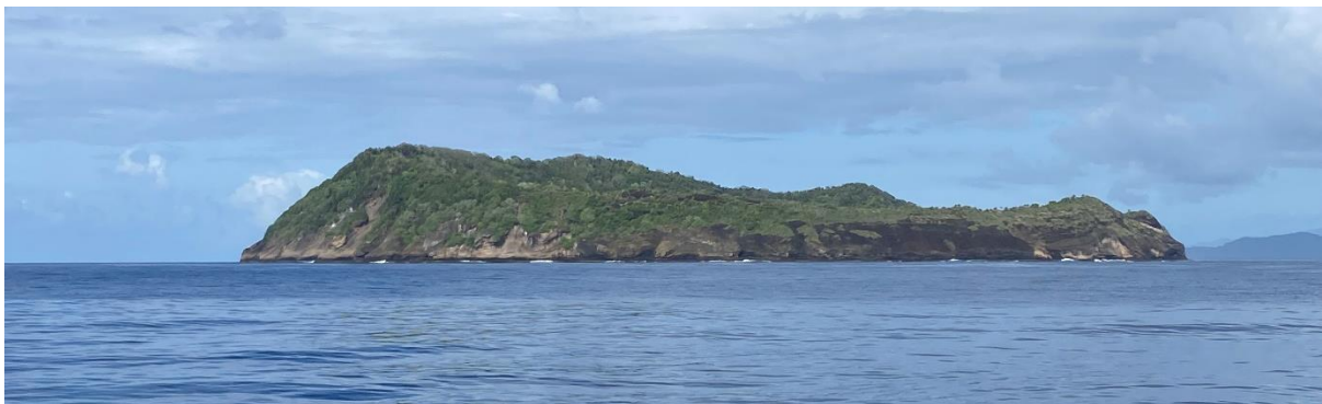
Figure 1. Apolima Island.

We left Apia Harbour in stunningly calm conditions at 0510hrs. Then along the north coast of Upolu and through the Apolima Strait, passing Apolima Island close enough to check out the red-footed boobies nesting in the trees.