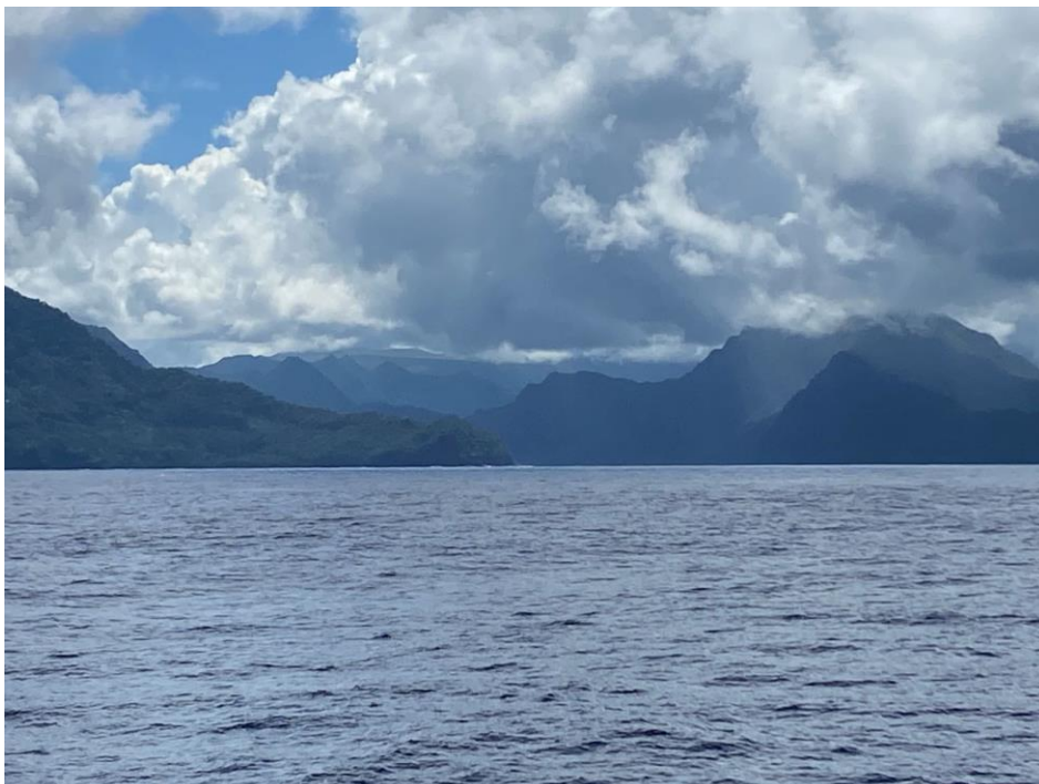
Figure 4. View towards Uafato and Fagaloa Bays, uplands of Upolu visible in the cloud beyond.

Viewing the impressive, rugged mountains behind Uafato and Fagaloa Bays from the sea, and the high slopes of Upolu beyond, begged the question, what seabirds could be breeding on those steep slopes and high peaks.