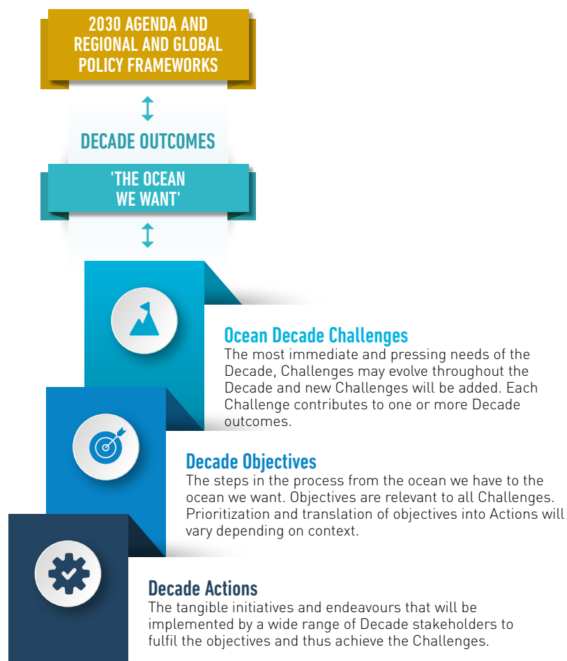
FIGURE 1. THE OCEAN DECADE ACTION FRAMEWORK

“The Ocean Decade envisages nothing less than a revolution in ocean science that will trigger a step change in humanity's relationship with the ocean.