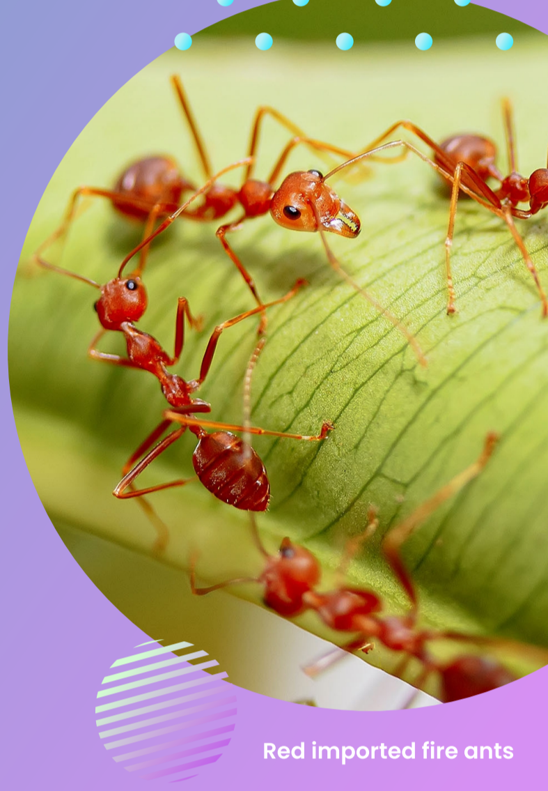
Red imported fire ants

Finally, if you haven't seen it already, check out this article that estimates how much red imported fire ant could cost your country if it established (see Table 4 for a summary of all impacts). If this ant establishes in all the SPREP/SPC member countries it could cost the region USD329 million per year in impacts. Another good reason to make sure your international and inter-island biosecurity/quarantine teams are well resourced to prevent these invaders.