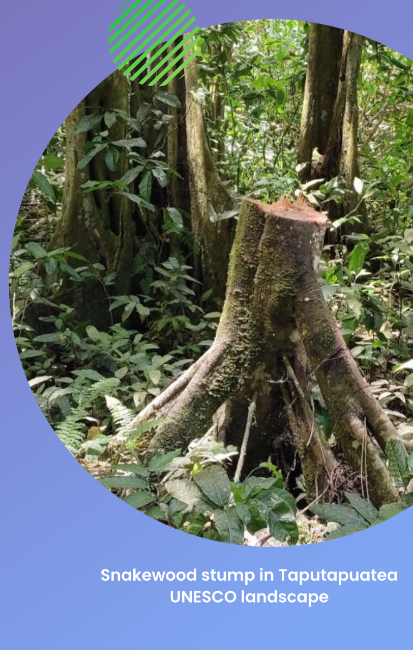
Snakewood stump in Taputapuataea UNESCO landscape

Further sites within the UNESCO landscape are being identified and will see restoration activities in 2022 and 2023.