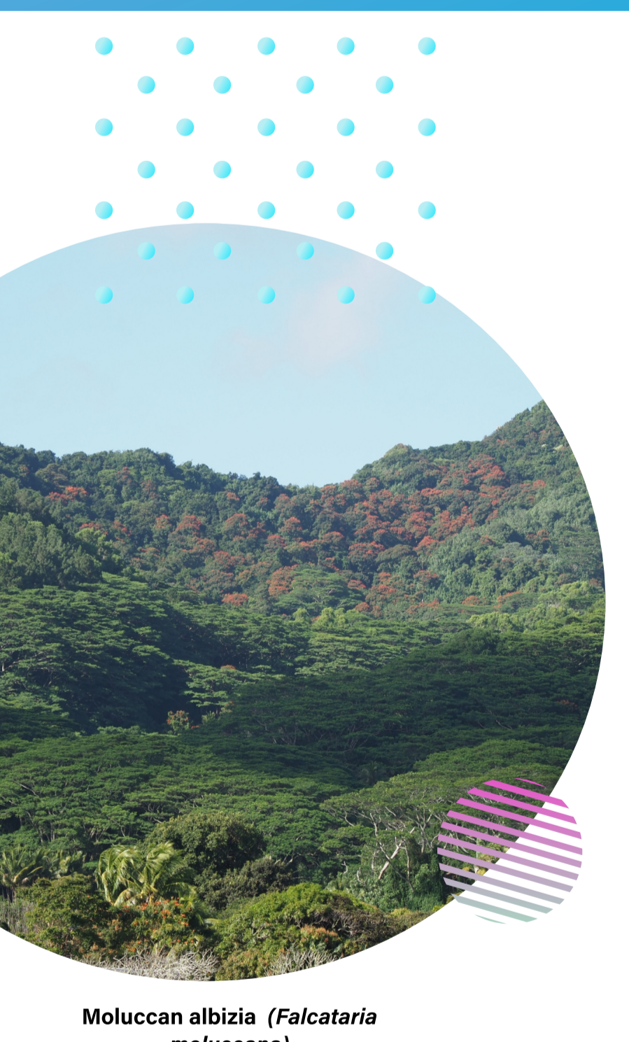
Moluccan albizia ( Falcataria moluccana )