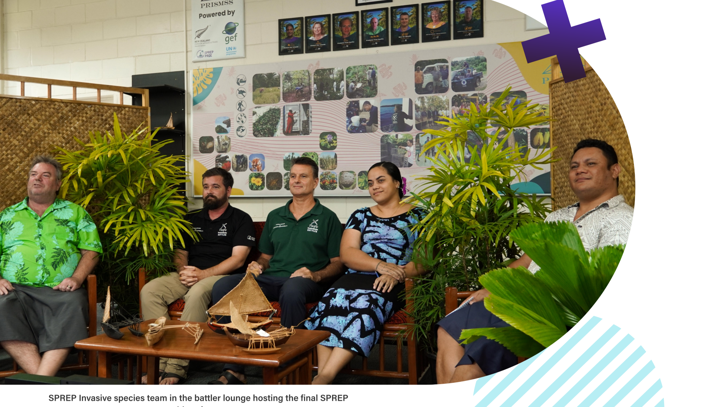
SPREP Invasive species team in the battler lounge hosting the final SPREP webinar for 2021

Other key PRISMSS core activities include the continuing development of the PRISMSS Capability Development Framework which will facilitate the mapping of national and regional capability in implementing the five PRISMSS regional programmes. The framework will identify training needs and inform donors of country readiness to implement a program.