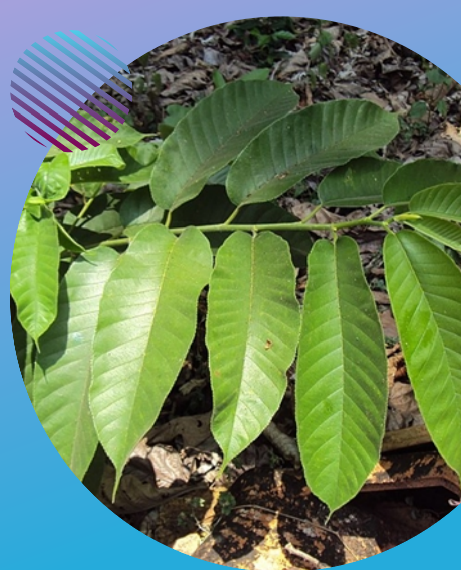
Panama rubber tree ( Castilla elastica ) - a deciduous latex-producing tree significant threat to native forest ecosystems

The Department of Environment team received training from the PRISMSS War On Weeds programme in the use of a data recording tool called Fulcrum. This application enables the team to record data in the field from their phones. The War On Weeds programme is funded by the GEF6 Regional Invasives Project.