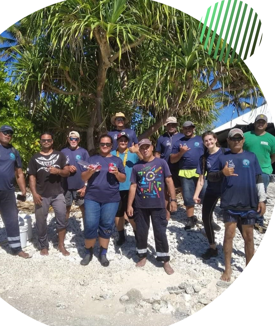
Environment Service Team Wallis & Futuna