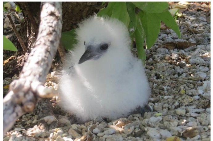
Tavake (Red Tailed Tropicbird) chick on Motu Kena

In our last newsletter we launched our fundraising campaign for the Suvarrow rat eradication. This campaign seeks to raise $50,000NZD to fund a crew to return to Suvarrow atoll to eradicate the last of the kiore or polynesian rats ( rattus exulans ) that we recently found on Motu Kena. You can read more about this campaign on our TIS webpage .