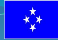
Federated States of Micronesia 59