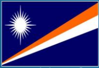
Republic of Marshall Islands 34