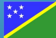
Solomon Islands 584,578