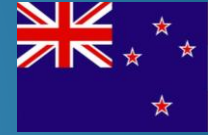
New Zealand 7