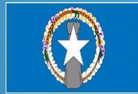
Commonwealth of Northern Mariana Islands 51,395