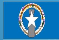
Commonwealth of Northern Mariana Islands 14