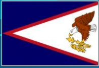
American Samoa 7