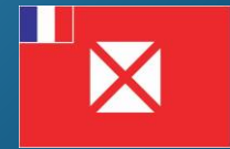
Wallis and Futuna 3