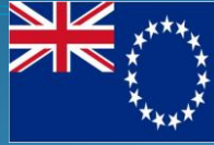
Cook Islands 10,777