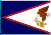
American Samoa 54,947