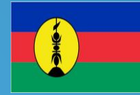
New Caledonia 36