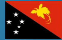
Papua New Guinea 151