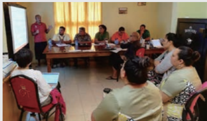
▲ A team from Samoa is learning about waste fee collection systems at the waste association of Tonga.

The officers in charge of solid waste management in Samoa were dispatched to Tonga, Fiji and Vanuatu to obtain training on how to launch waste fee collection systems. Such learning experiences have resulted in intra-regional collaborations in the Pacific region.