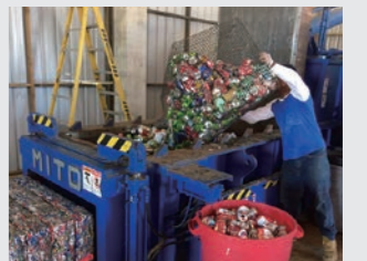
▲ Crushing aluminum cans using a press machine donated from Japan.

Approximately 16 million containers, such as cans, glass and plastic bottles, among others, were collected in the first year after the CDS was launched. The aluminum cans are exported out of the region for recycling.