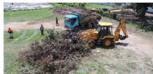
▲ Activities to remove disaster waste from the cyclone aftermath in Tonga.

JICA's World, October 2018 A Cyclone Hits! Disaster Waste Management in Tonga