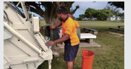
▲ waste collection from households

Weekly waste collection and recycling services have started in the remote islands, the litter that used to spread all over the islands and illegal dumping have been eliminated, and the living environment has improved.