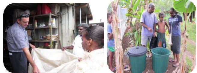
Visit to a private recycle company for discussion (Left) and Pilot compost for organic waste (Right)