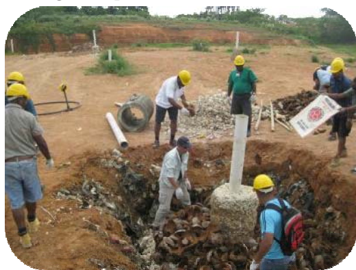
Practical demonstration of installation of a multi-layer Leachate Treatment Facility at the Bouffa Landfill.

The Regional Training on Landfill Management was conducted from 10 th to 14 th October 2011 in Vanuatu in cooperation with counterpart organizations in Vanuatu, the Department of Environment Protection and Conservation, and Port Vila Municipality. 14 participants from 5 countries (Fiji, PNG, Samoa, Solomon Islands and Vanuatu) gained technical knowledge and skill in how to improve waste disposal facilities and their operation using the Semi-aerobic Landfill Method through the 5 days' intensive lectures and practices at Bouffa Landfill in Port Vila. Those who have participated are now working on improvements of their own dumpsites in order to put the knowledge into practice.