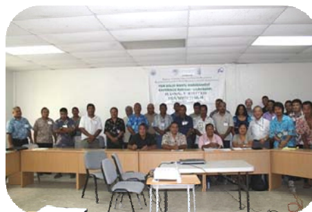
The FSM Solid Management Experience Sharing Workshop in Kosrae