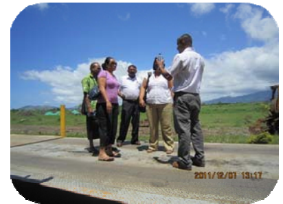
A staff of LCC is explaining the weighbridge operation system to the Samoa counterparts at Vunato Disposal Site in Lautoka, Fiji.

experience on how the LCC has been properly managing the weighbridge operation system in terms of disposal fee levying mechanism, data recording and analysis system, etc., on the basis of their several years' experience of utilizing a weighbridge system through another JICA's successful technical cooperation project "Waste Minimization and Recycling Promotion Project in Fiji (JICA 3R Project)" (from 2008 to 2012). The participants from Samoa are expected to apply the management method of LCC successfully.