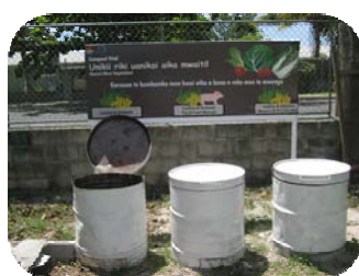
Home Compost Trial at Teaoaraereke in collaboration with a Women group (left) and at BTC (right)