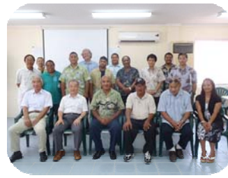
Kickoff meeting of J-PRISM RMI at Majuro