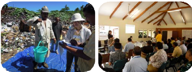
Waste Amount & Composition Survey (Left) and Workshop on Solid Waste Management Plan for Vava'u (Right)

Port Vila Municipality conducted the house-hold waste characterization in November. Total number of house-holds surveyed was 50. Business waste audit is on plan to be undertaken in early 2012.