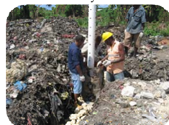
Topographic Survey at Gizo Dumpsite (Left) and Demonstration of installing Gas Vent Facility at Ranadi Dumpsite in Honiara (Right)