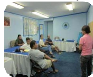
Capacity Assessment Workshop in Koror facilitated by JICA Expert