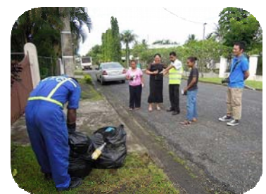
Observation of collecting recyclables in Nadi Town, Fiji.