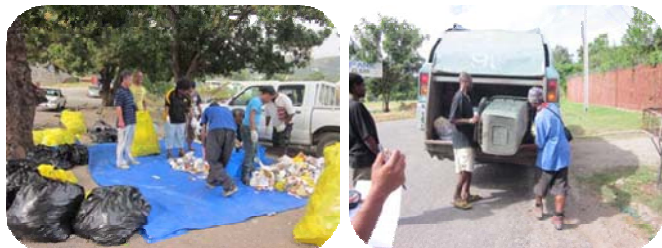
Waste Characterization Study (Left) and Time & Motion Study (Right)