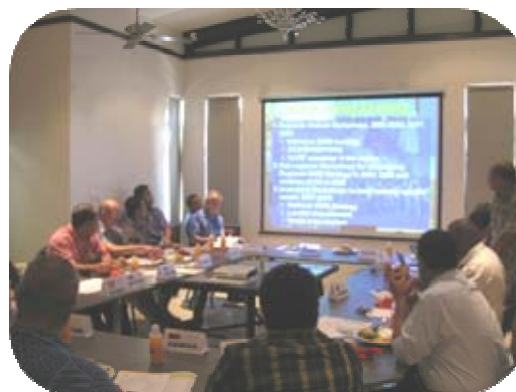
1 st Steering Committee Meeting at Tanoa Tusitala Hotel, Apia, Samoa