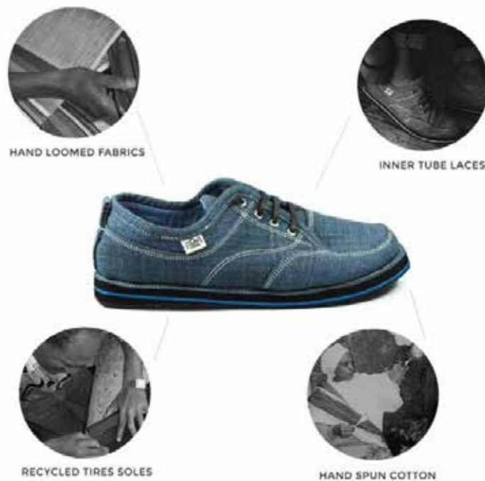
Sole Rebels manufactures shoes from recycled products and describes itself as “Green by Heritage” 33

Sole Rebels 32 is an Ethiopian company that makes shoes from recycled materials.