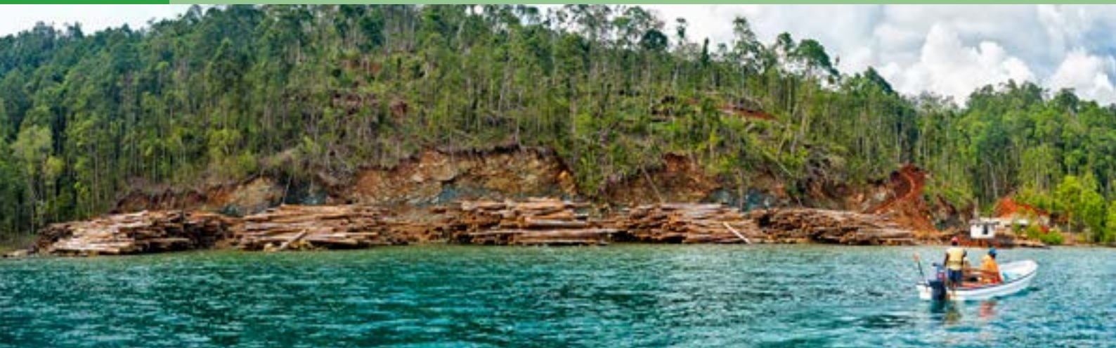
Log loading dump, Choiseul, Solomon Islands