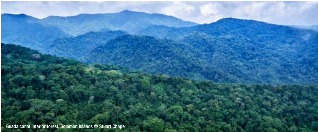
Guadalcanal interior forest, Solomon Islands