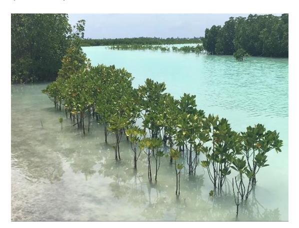
Figure 4. Recently planted saplings of Rhizophora stylosa on Tarawa (with some older stands in the background).

support from local community groups, and the potential benefits it would generate in protecting the island from the growing threat of sea level rise, there is scope for further mangrove planting in Tarawa (Kiribati).