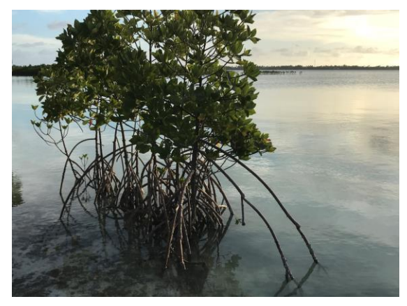
Figure 2. Rhizophora stylosa

The mangroves in South Tarawa are dominated by Rhizophora stylosa, with some Bruquiera gymnorhiza, Lumnitzera racemosa and Sonneratia alba (Scott, 1993). The mangroves in South Tarawa have been affected by a growing human population, including clearance for development and pollution (Spalding et al., 2010). The acute shortage of land has led to extensive reclamation of the lagoon foreshore and loss of mangroves, along with their exploitation for construction material (Scott, 1993; p. 205).