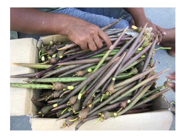
Common reasons for failure

The timing for mangrove planting will depend on the availability of propagules. In Tarawa, propagules are generally abundantly available during August -October. Ripe propagules can either be planted directly into the substrate at a restoration site, or first grown up in a mangrove nursery for several months before planting. Although involving additional labour and time, nursery-grown seedlings tend to show higher survival rates in mangrove planting programs.