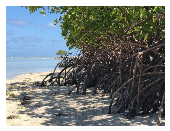
Figure 1. Natural mangrove stand in North Tarawa

These guidelines have been written for local government staff (e.g. from the Ministry of Fisheries or Environment), scientists and NGO's in the region, with the intention that they work in close collaboration with local communities to implement mangrove planting when and where that would considered appropriate.