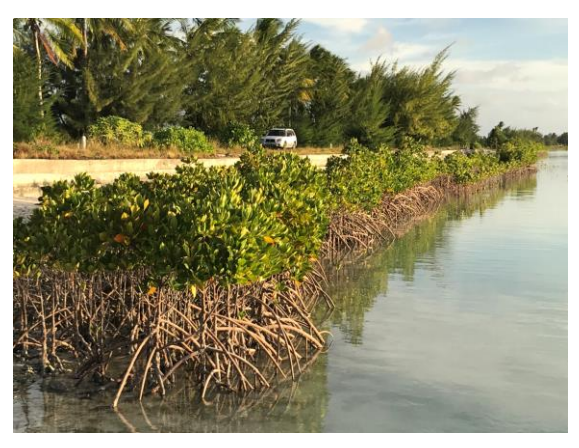
Figure 3. Rhizophora stylosa mangroves planted along the Ananau causeway (Tarawa)

There are growing efforts to restore and plant mangroves in Kiribati, including a project by the International Society for Mangrove Ecosystems, in association with local youth clubs and the government (MELAD), that has been planting mangroves in South Tarawa since 2005 as a means of reducing coastal erosion (Spalding et al., 2010; p.173; Baba et al., 2009; Baba, 2011).