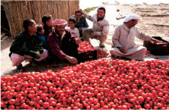
Farmers in Iraq collect tomatoes from lands cleared of landmines and unexploded ordnances (UXO)

tence farming. Second, it provides employment. Mine action (Demining, Victim Assistance, Mine Risk Education, Destruction of stockpiled landmines and Advocacy) is labour intensive and offers direct work opportunities for ex-combatants and unemployed youth. But it can also create employment indirectly by allowing people to use infrastructure, agricultural areas, and natural resources that had become inaccessible