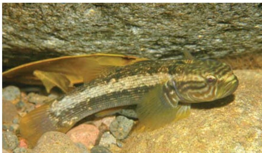
Belobranchus belobranchus (Valenciennes 1837)