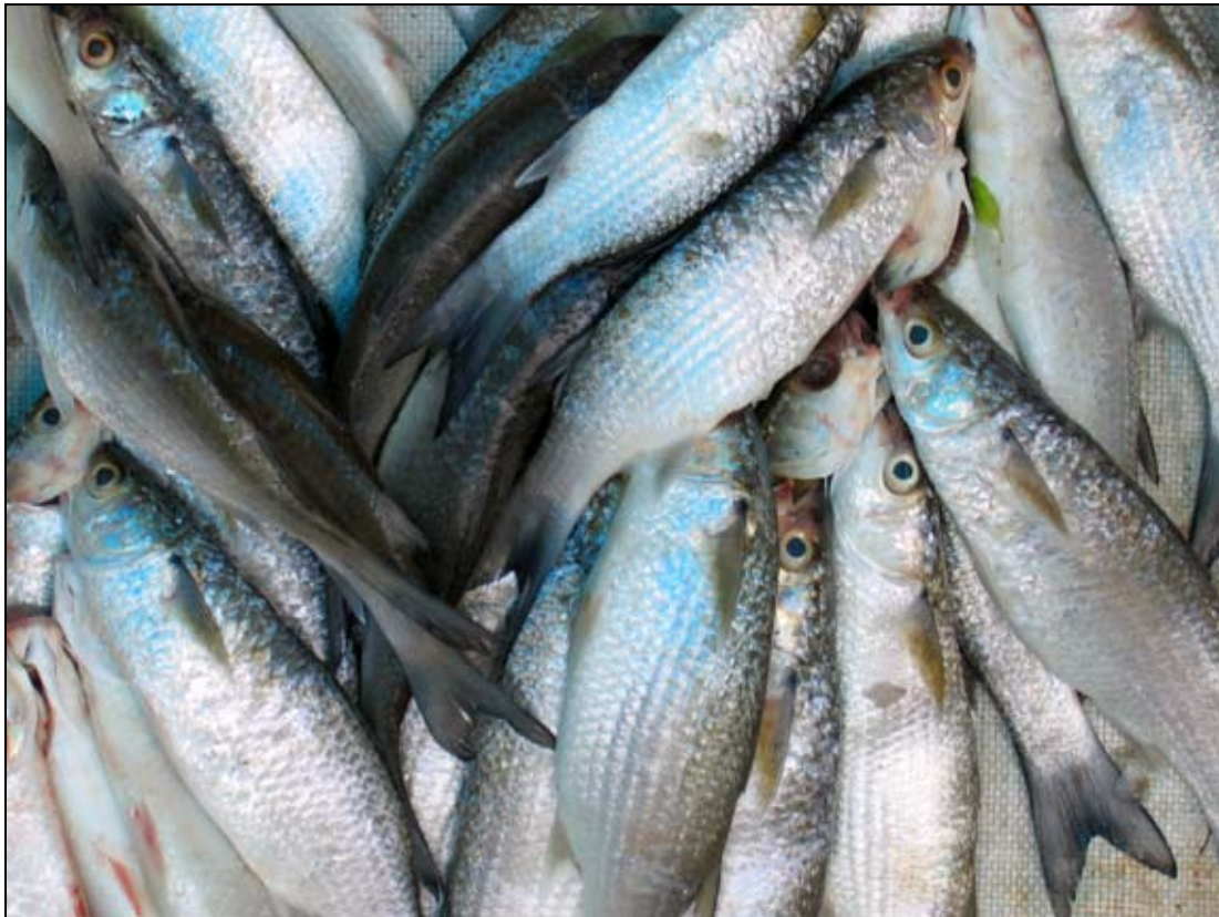
Suva Fish Market