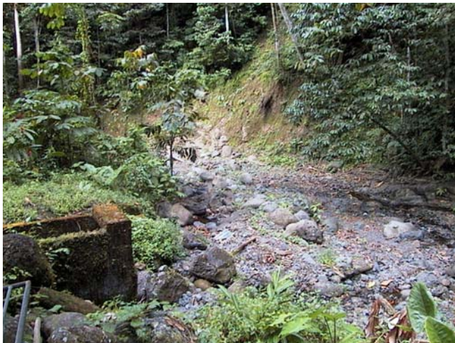
Figure 4: One of the main water supply sources dried up during dry season, Fuluasou river which is one of Samoa's most popular natural heritage sites.

With regards tourism, an industry that continues to grow and is the leading income earner for Samoa, its planning processes and strategic framework recognises the value of working in a mutually supportive partnership with environmental management. Hence, its advanced adoption of integrated planning for sustainable tourism development will merely enhance any efforts geared towards developing tourism interest within this catchment zone. Efforts such as further