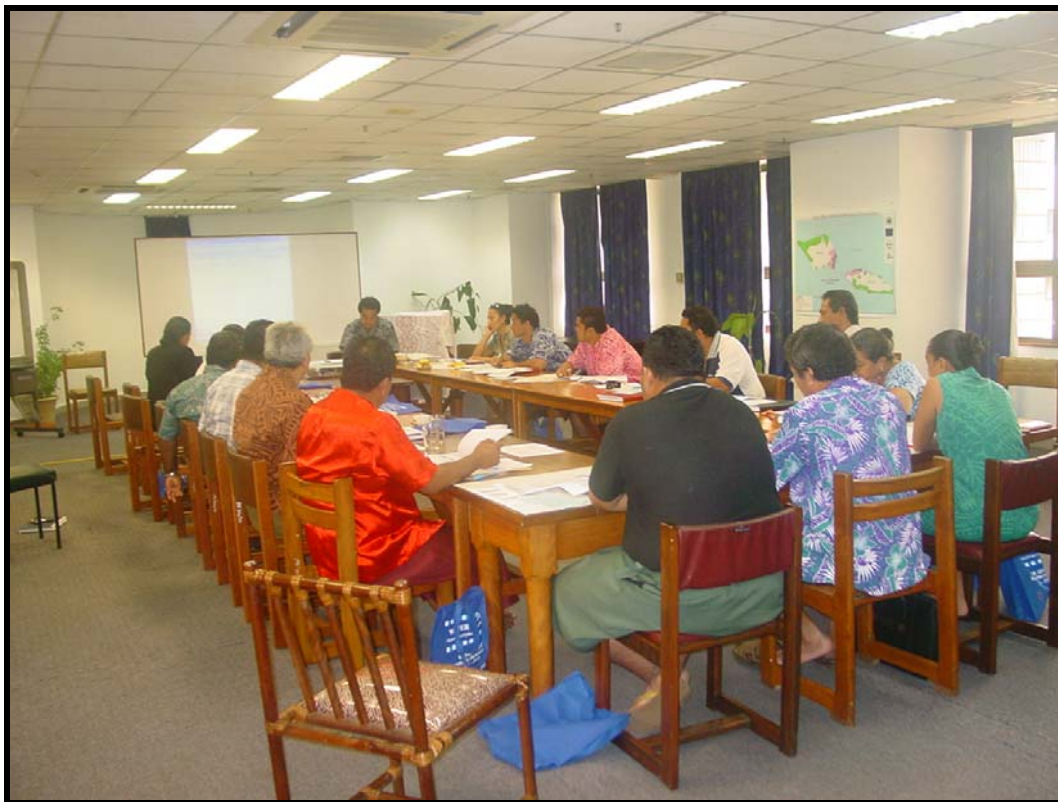
Figure 1 Participants at Workshop on 28 February 2007

The workshop held on 6 March 2007, although not in full attendance like the first one, was nevertheless very interactive and gained consensus on the prioritized HS area – the Apia Catchment. Details for putting together the demonstration project concept paper were easily gathered by the workshop participants.