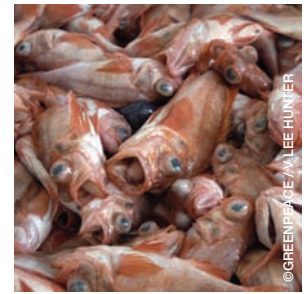
image Red Fish from the Eastern princess II, approximately a 4 to 5 ton catch. The Eastern Princess is bottom trawling within EEZ (Canadian 200 Mile zone) for Red Fish ( Sebastes Marinus ) at approx depths of 350 meters. Greenpeace has been documenting and protesting the high seas bottom trawl fleets in the Northwest Atlantic.