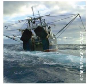
image The New Zealand deep sea trawler 'West Bay' does a fast turn after hauling its catch from international waters in the Tasman Sea. Greenpeace is tracking progress by RFMOs with competence to manage bottom fishing activities in implementing conservation measures to prevent adverse impacts on vulnerable marine ecosystems from bottom trawling, as mandated by the UN General Assembly.