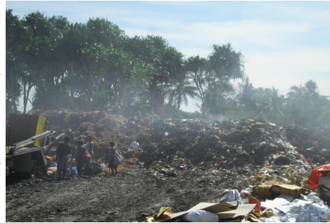
Above Right: Side Embankment ground work in progress.

The Rehabilitation of Ranadi Dumpsite is one of J-PRISM Project’s major activities for this year, 2012. Progress from the two project sites in Glz.o and Honiara indicates that there is some initial ground work . Similarly, Gizo counterparts are also in progress with the work towards the rehabilitation construction at the Gizo dumpsite. In both sites, the EIA Report is already been compiled and to be submitted to the Director of Environment and Conservation Division prior to receiving a development consent for construction work to be in full force.