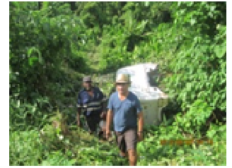
Above: Bush tracking in Gizo for landfill boundary

He also held in-house demonstrations with both counterparts in Honiara and Gizo on the process to rehabilitate the Ranadi dumpsite and Gizo Dumpsite. During his visit and presentation of the Fukuoka Method, all Solomon Counterparts now have a clear direction of what needs to be done.