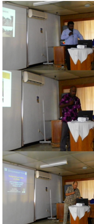
Above: Speakers during the Joint Coordinating Committee (JCC) Meeting Held.