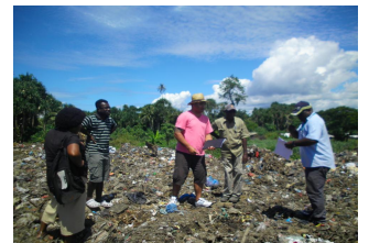
Below: Onsite discussions at Ranadi.

“ The Clean School Program was a fun way of educating children on 3R’s to promote waste minimization in the community”