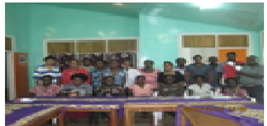
Primary School Teachers Workshop facilitated by Gizo

demonstrated Composting method during this environmental education awareness. Counterparts in Gizo have also conducted clinical awareness .