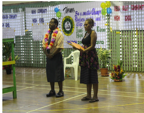
Above: Official Launching of National Clean Campaign.

The Launching of the National Clean Campaign in Honiara and Gizo was on 29th March 2012. Prior to the launching, Honiara counterparts held a Ministers Forum on Waste Management and Pollution Control at the Forum Fisheries Agency. There was some interesting presentations that are presented for the Ministers of the Crown who were present. In Gizo, counterparts organized a major clean up campaign with the theme “ Pick it Up Gizo”.